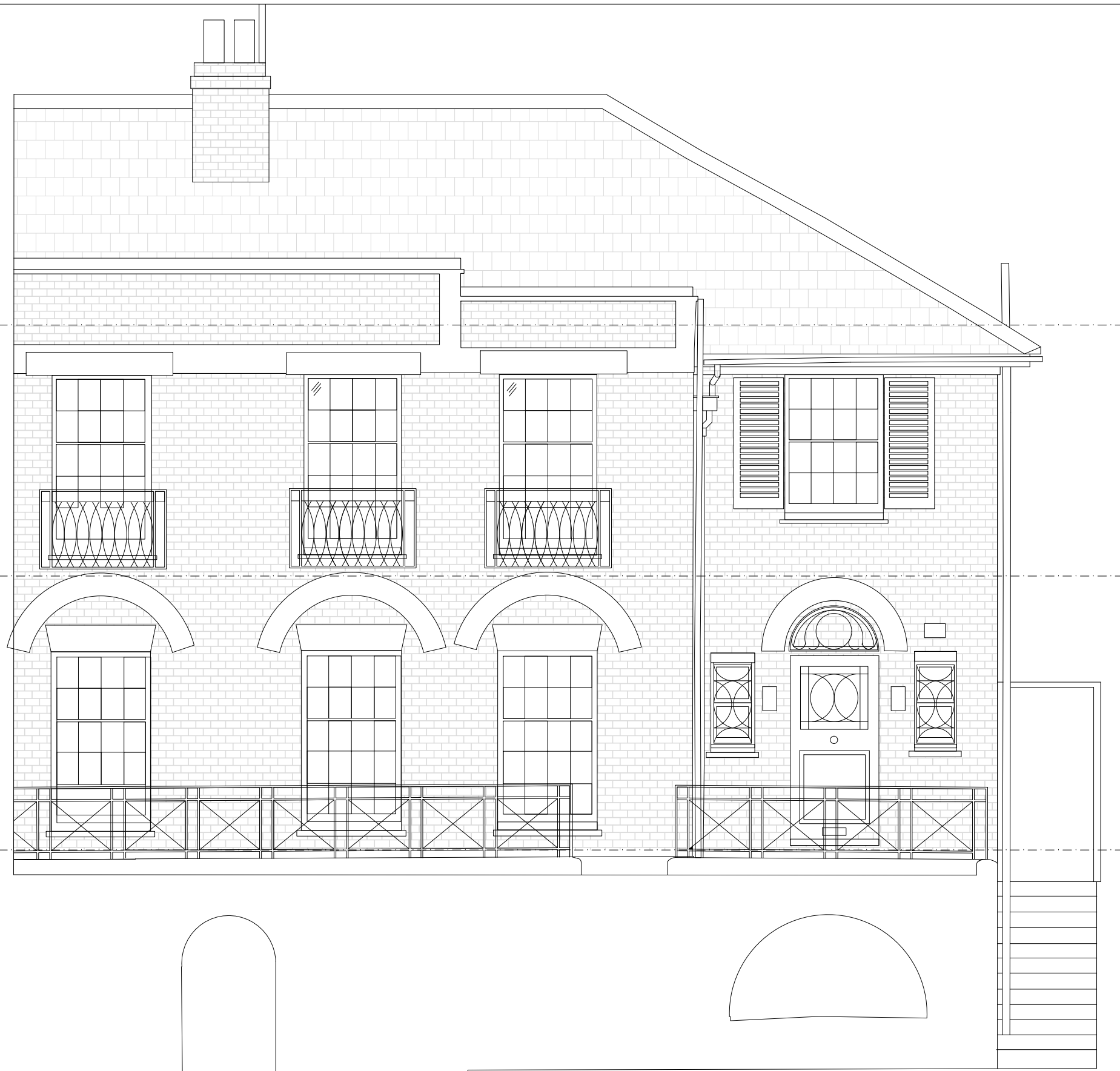
1 PROPOSED FRONT ELEVATION SCALE: 1:50