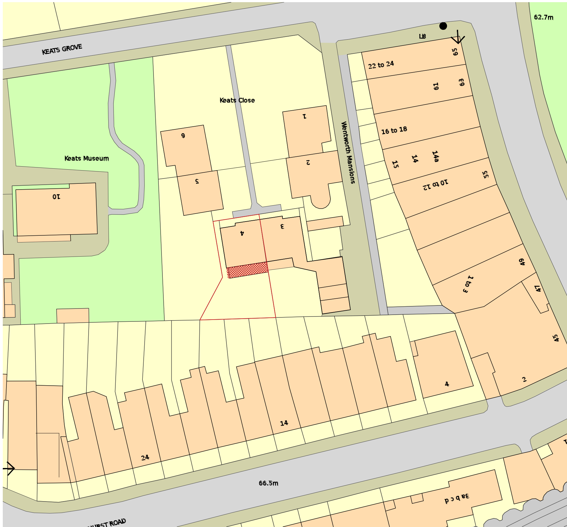
2 SITE BLOCK PLAN SCALE: 1:500

THIS DRAWING IS THE COPYRIGHT OF STUDIO LATTICE ARCHITECTS. THE CONTRACTOR IS RESPONSIBLE FOR CHECKING CONDITIONS, DIMENSIONS, TOLERANCES AND REFERENCES ON SITE INSPECTION. ANY DISCREPANCY TO BE VERIFIED WITH THE ARCHITECT BEFORE PROCEEDING WITH THE WORK. WHERE AN ITEM IS COVERED BY DRAWINGS TO DIFFERENT SCALES THE LARGER SCALE DRAWING IS TO BE WORKED TO. DO NOT SCALE DRAWING. FIGURED DIMENSIONS TO BE WORKED TO IN ALL CASES.