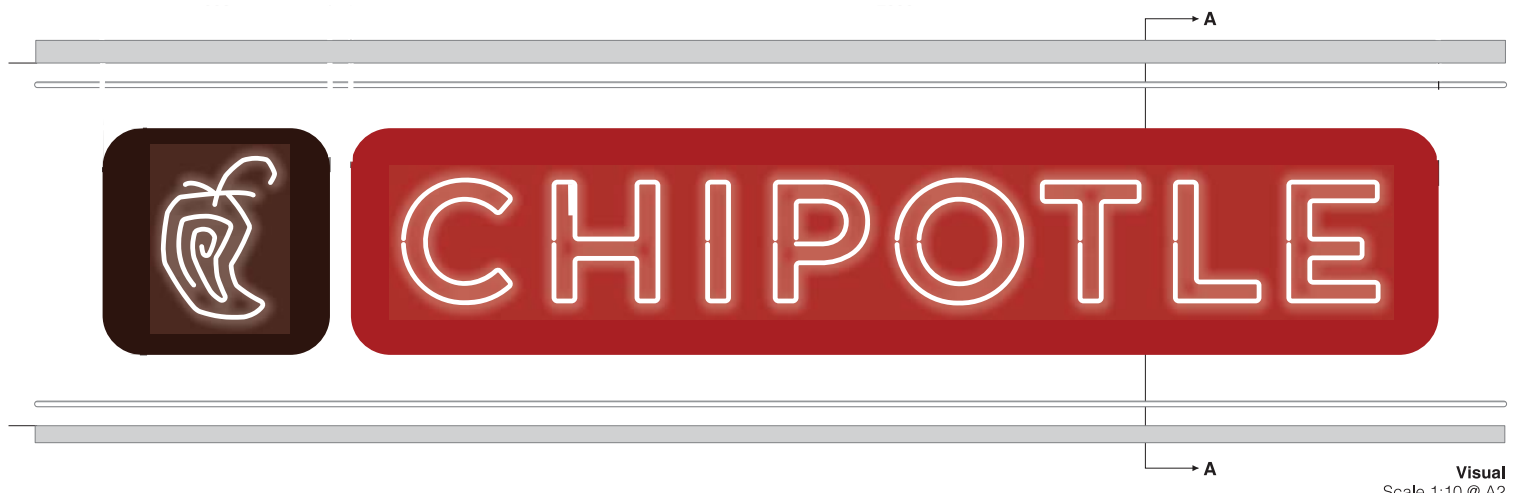
Visual Scale 1:10 @ A2