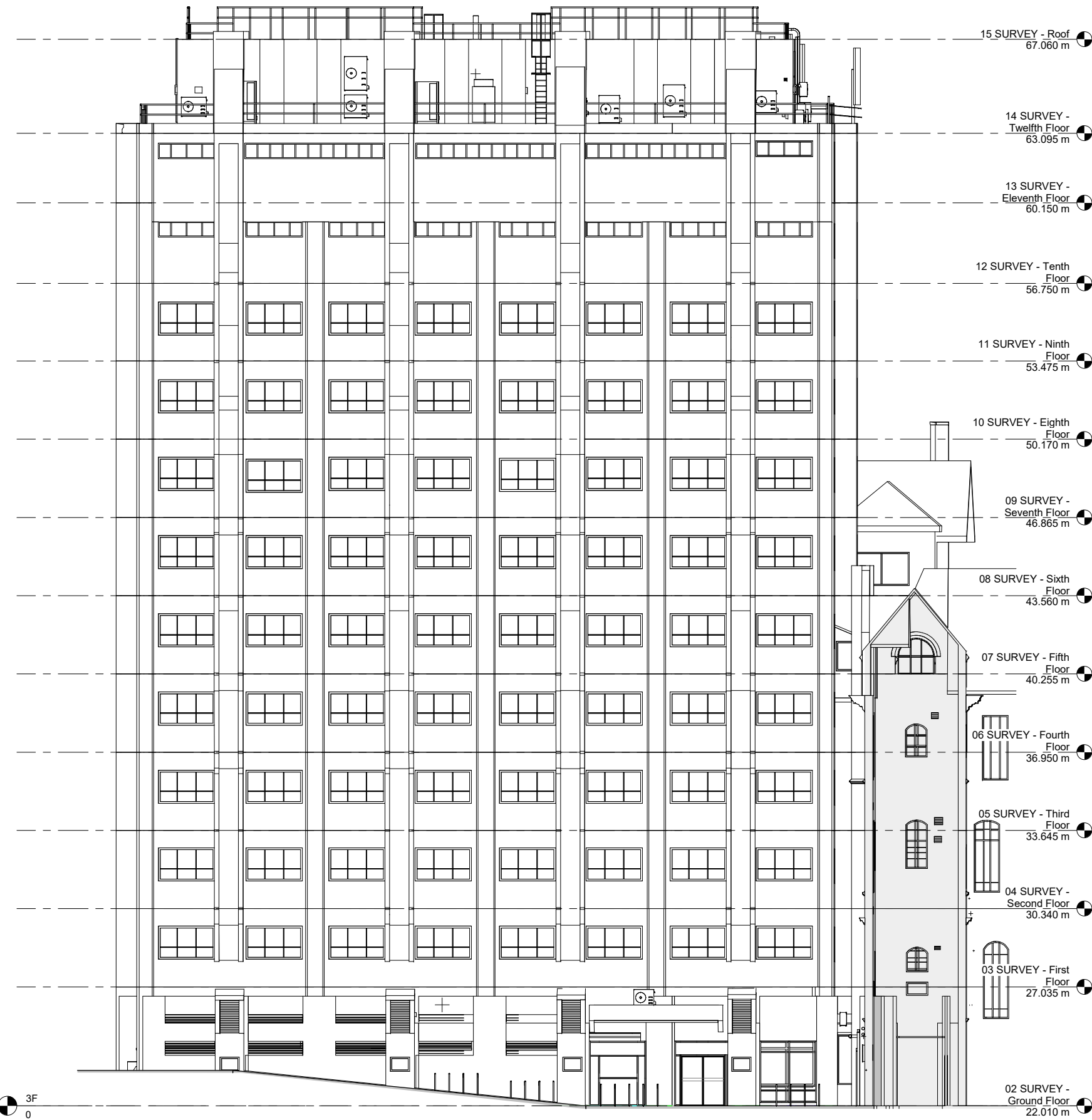
B Elevation B - Existing 1 : 100