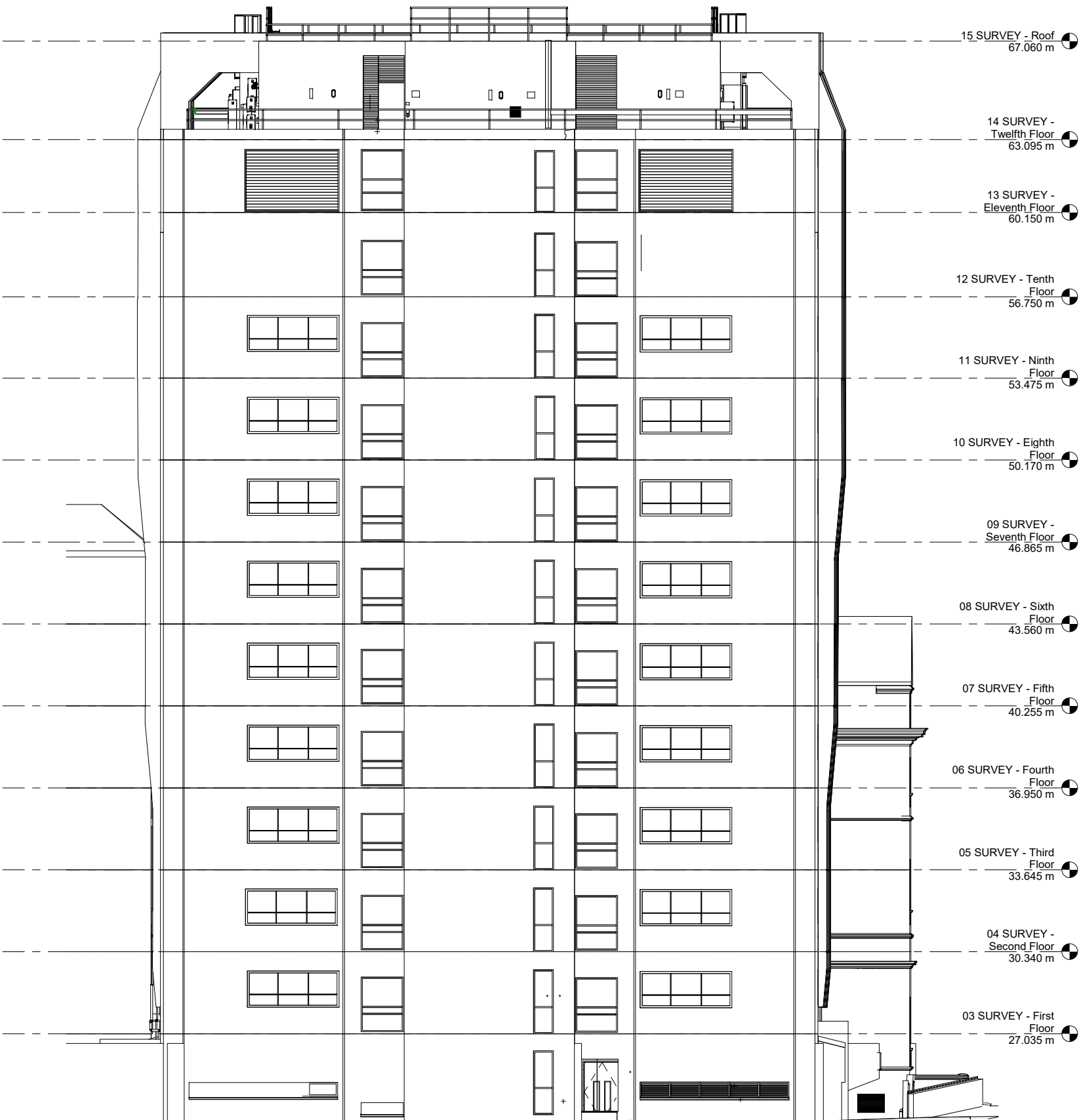
A Elevation A - Existing- 1 : 100