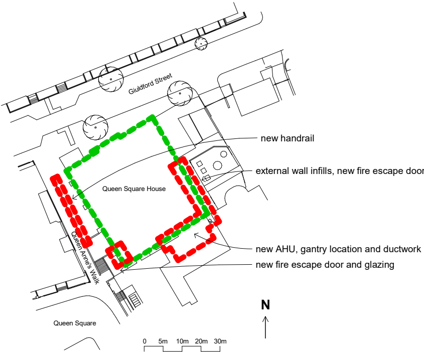
2 Site Plan 1: 500

Areas where works are proposed and relevant to planning