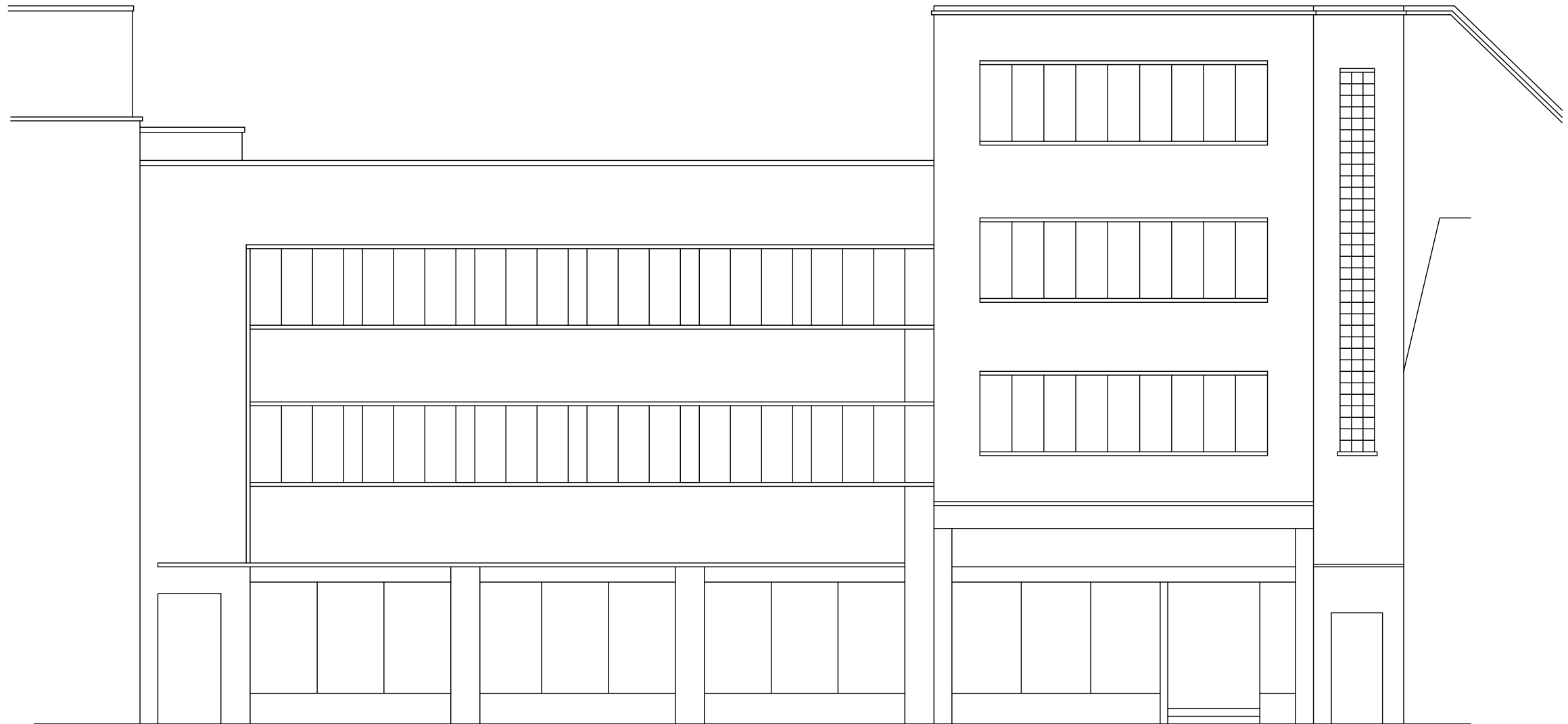
SHELTON ST ELEVATION