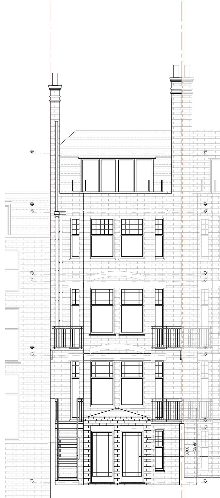
02 Proposed Rear Elevation 1:100 @A3