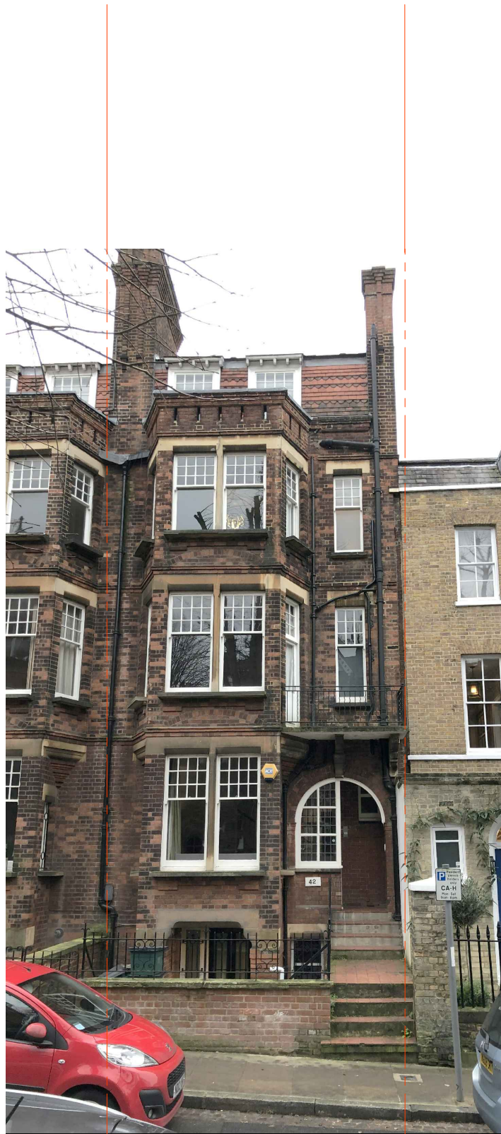
01 Front Elevation (As existing)