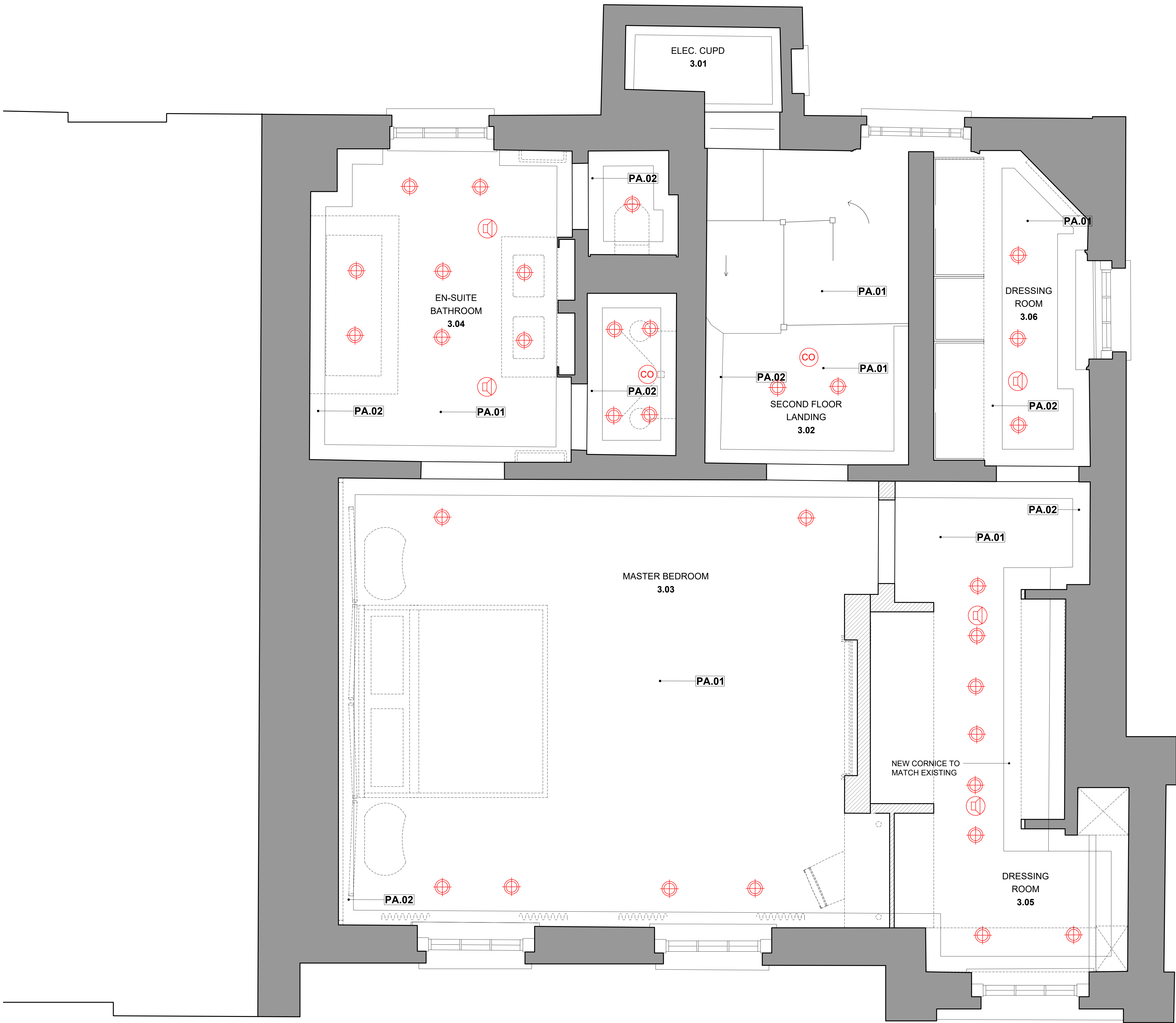
01 SECOND FLOOR RCP 1:20 @ A0