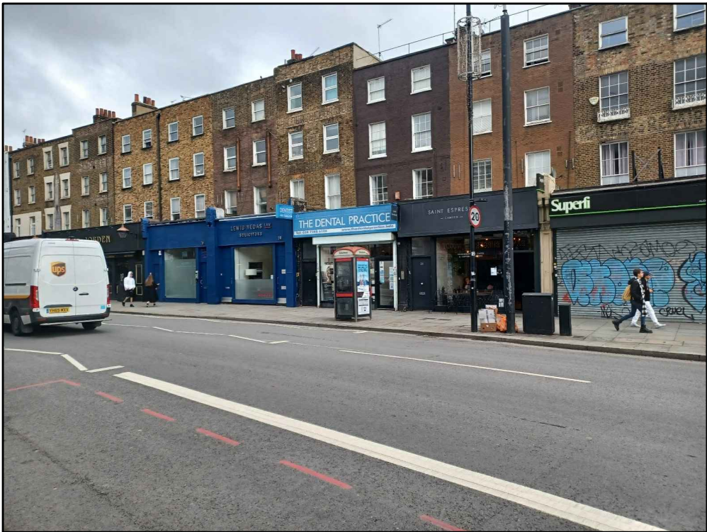
PROPOSED PHOTOMONTAGE NTS