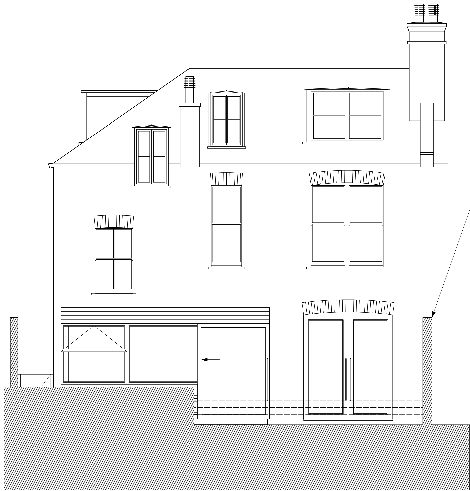
Proposed Rear Elvation