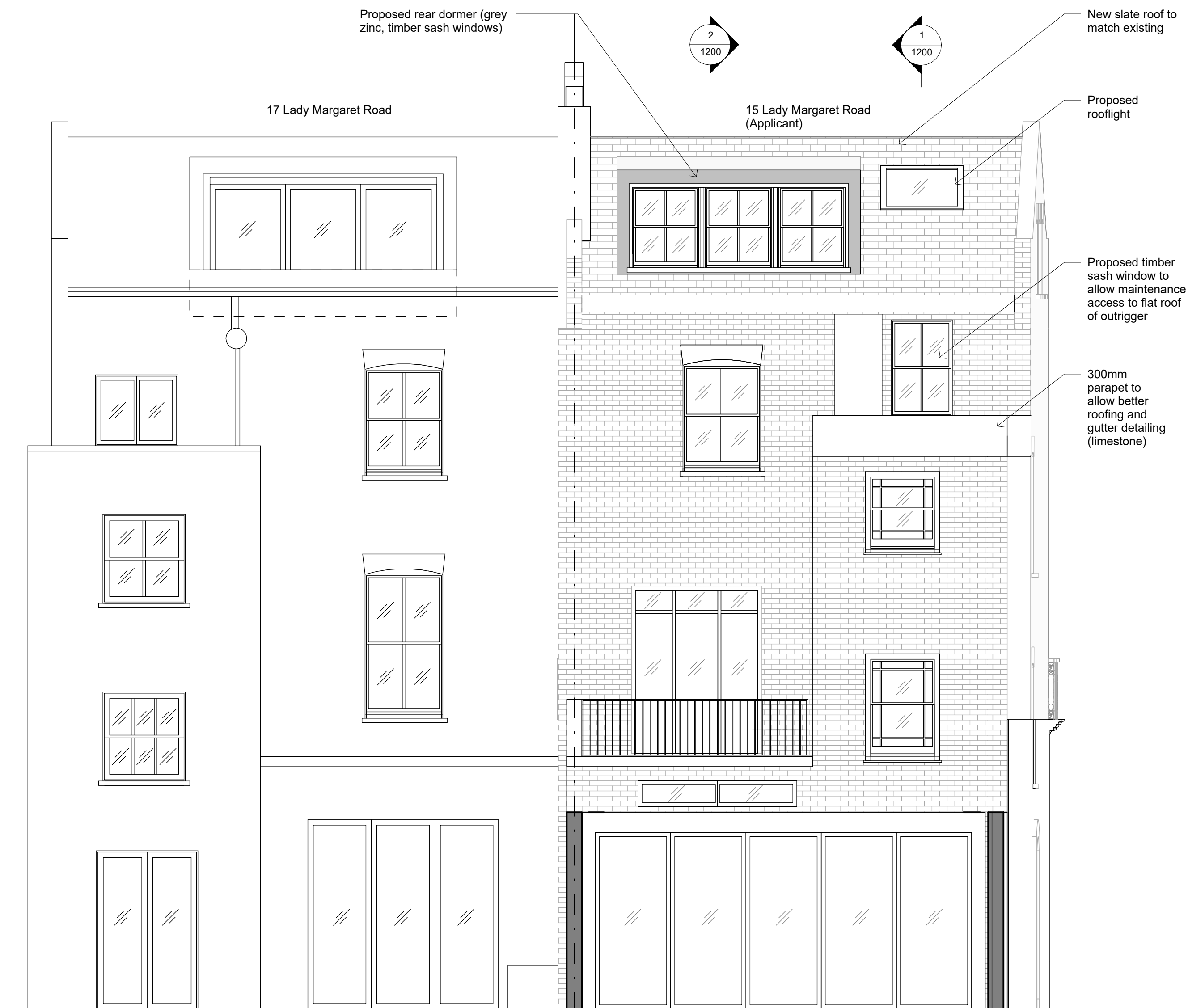
2 Proposed Rear Elevation 1 : 50