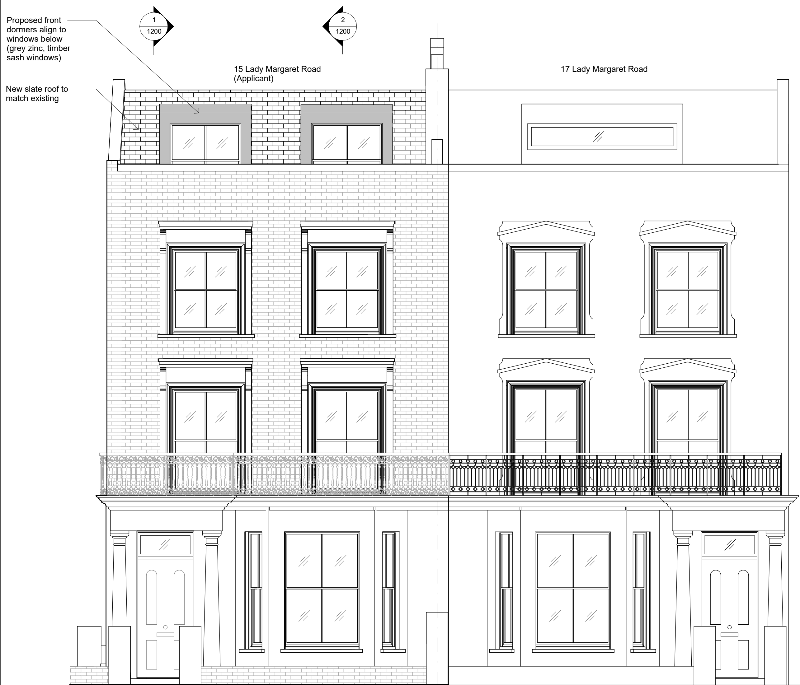
1 Proposed Front Elevation (Lady Margaret Road) 1 : 50