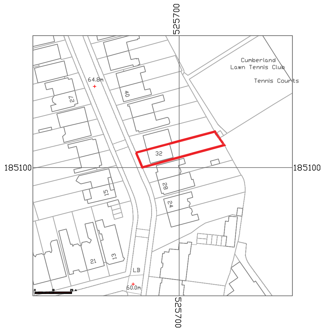
1 LOCATION PLAN Scale: 1:1250