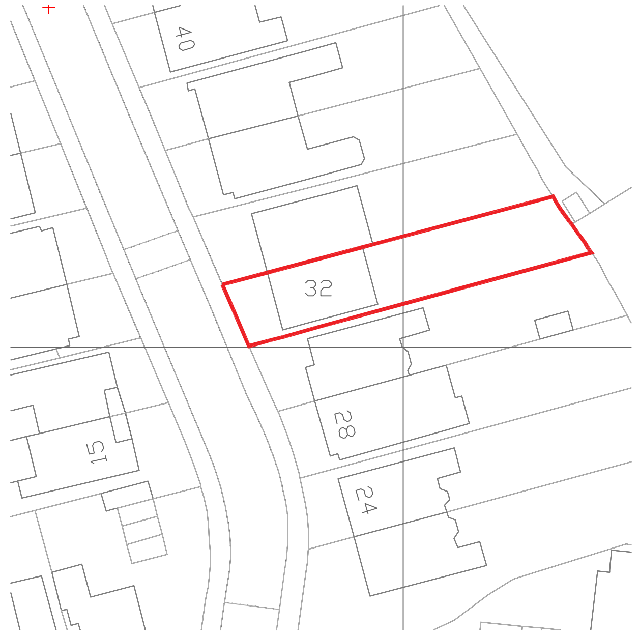
2 BLOCK PLAN Scale: 1:500