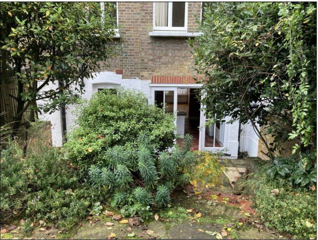
20 CARLINGFORD ROAD_ EXISTING SMALL TREES BESIDE GARDEN WALLS