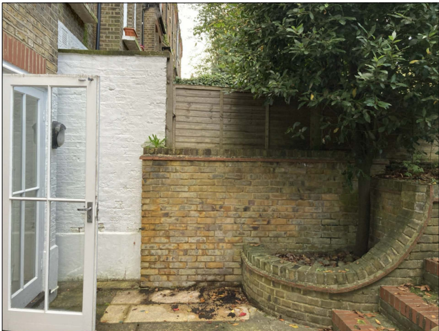
20 CARLINGFORD ROAD_ EXISTING GARDEN WALLS (FLANKING 22 CARLINGFORD ROAD)