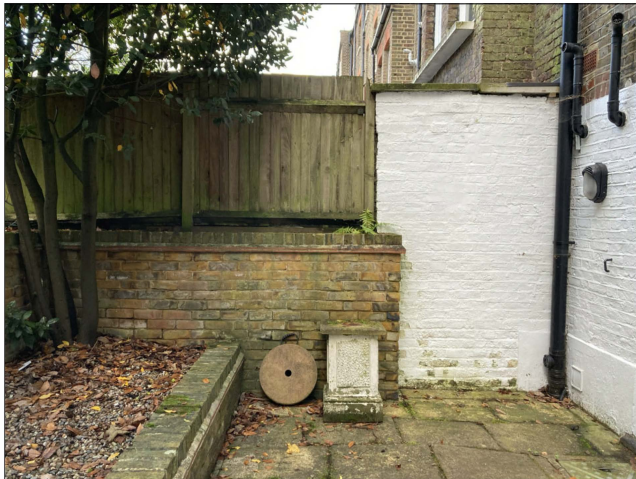
20 CARLINGFORD ROAD_ EXISTING GARDEN WALLS (FLANKING 18 CARLINGFORD ROAD)