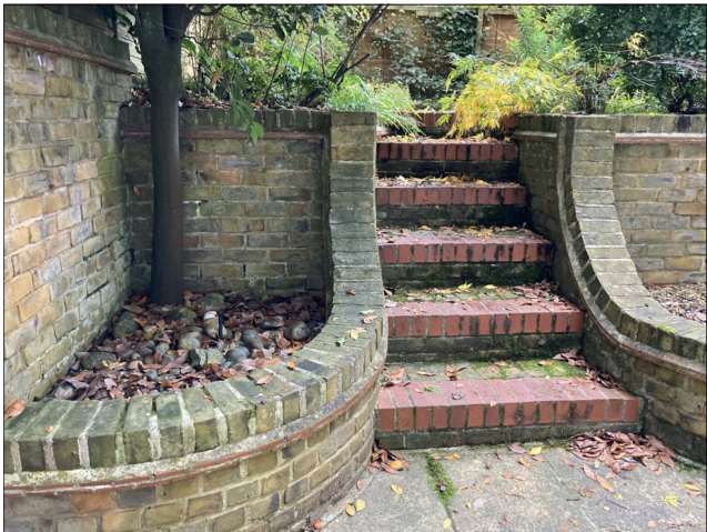
20 CARLINGFORD ROAD_ EXISTING GARDEN STEPS