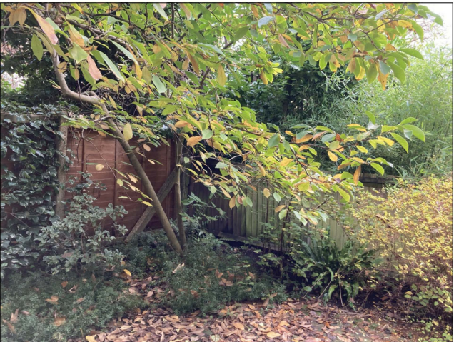
20 CARLINGFORD ROAD_ EXISTING MAGNOLIA TREE (FLANKING 18 DENNING ROAD)