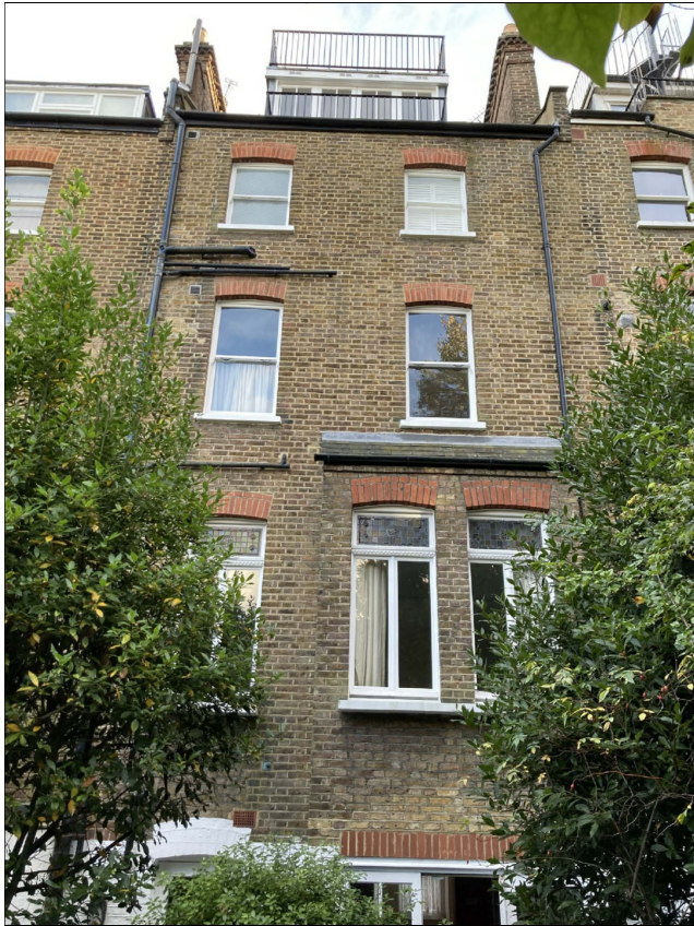
20 CARLINGFORD ROAD_ EXISTING REAR ELEVATION