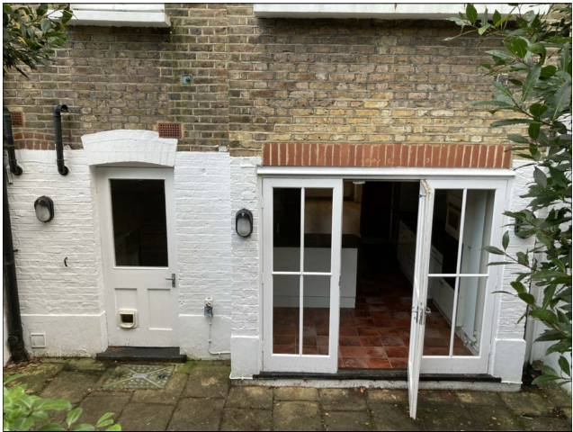
20 CARLINGFORD ROAD_ EXISTING REAR ELEVATION (LG FLOOR)