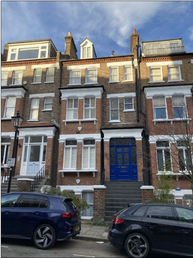
20 CARLINGFORD ROAD_ EXISTING FRONT ELEVATION

General Note Do not scale from this drawing. Verify all site dimensions and inform the contract administrator of any discrepancies prior to setting out and construction.