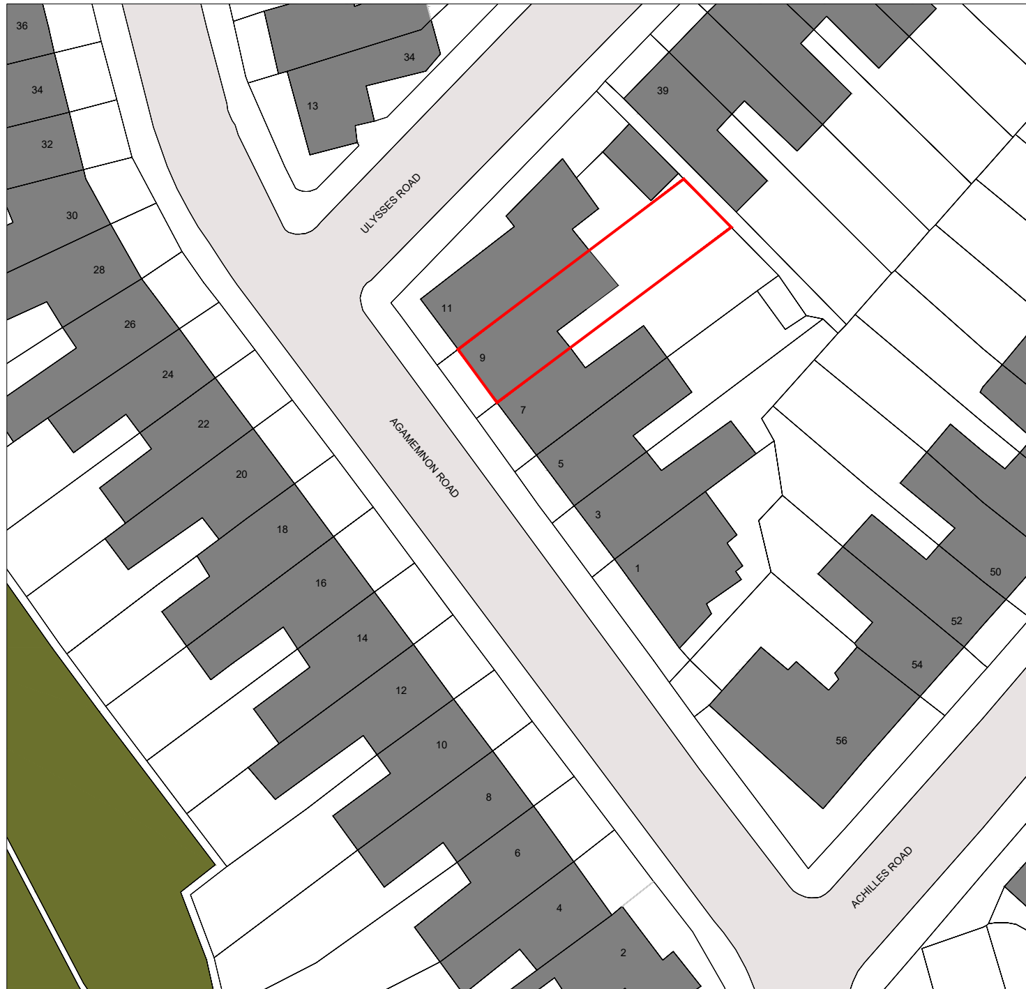
LOCATION PLAN SCALE 1:500