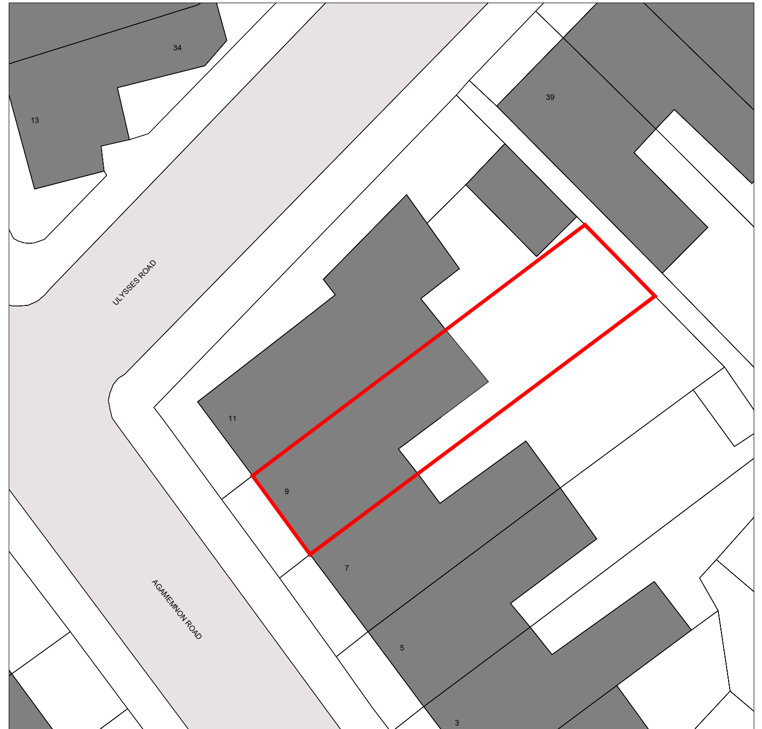
BLOCK PLAN SCALE 1:250