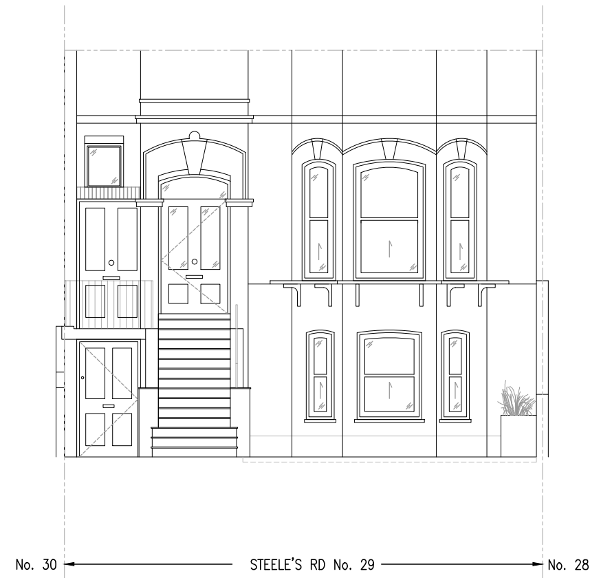
01 EXISTING FRONT ELEVATION SCALE: 1:100