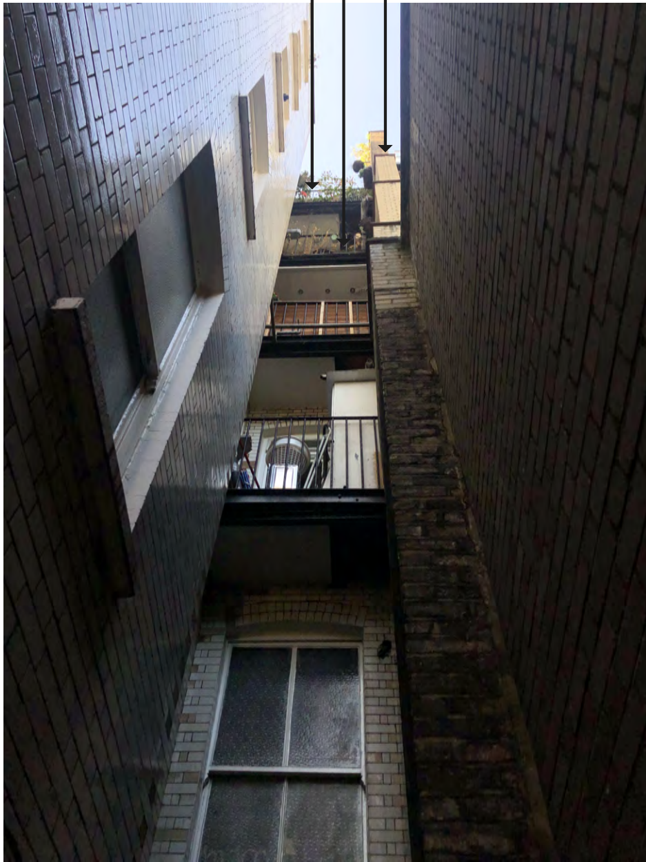
View from rear courtyard of building