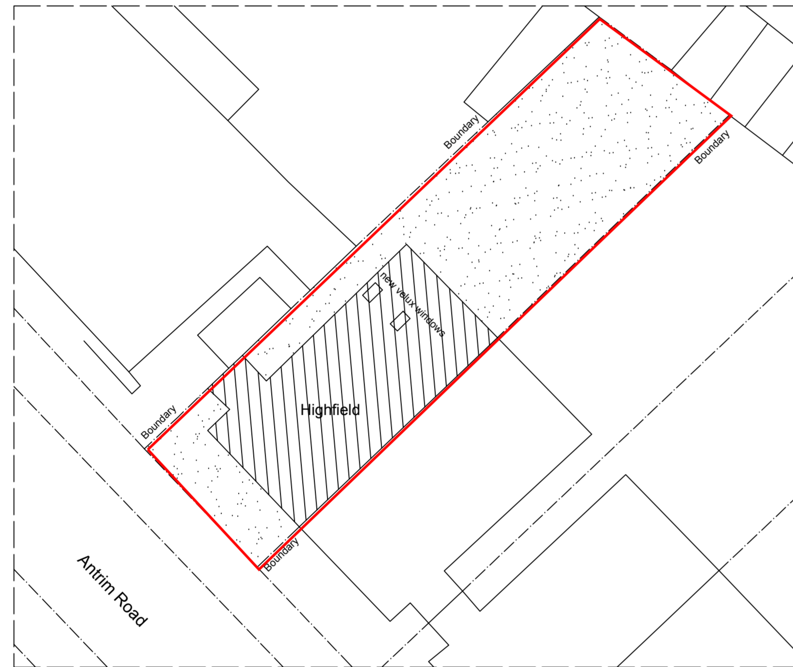
PROPOSED SITE PLAN scale 1:200