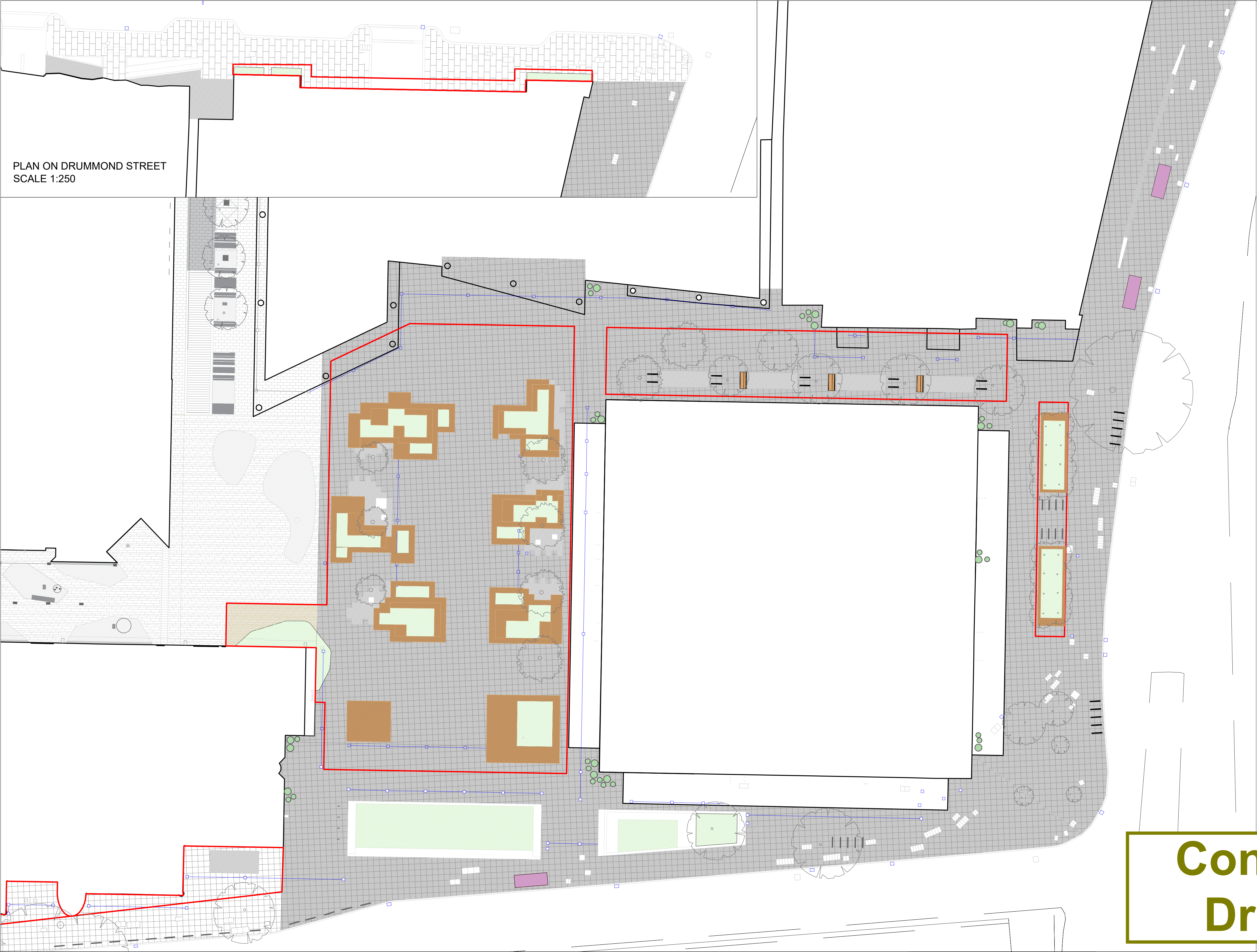
PLAN ON DRUMMOND STREET SCALE 1:250