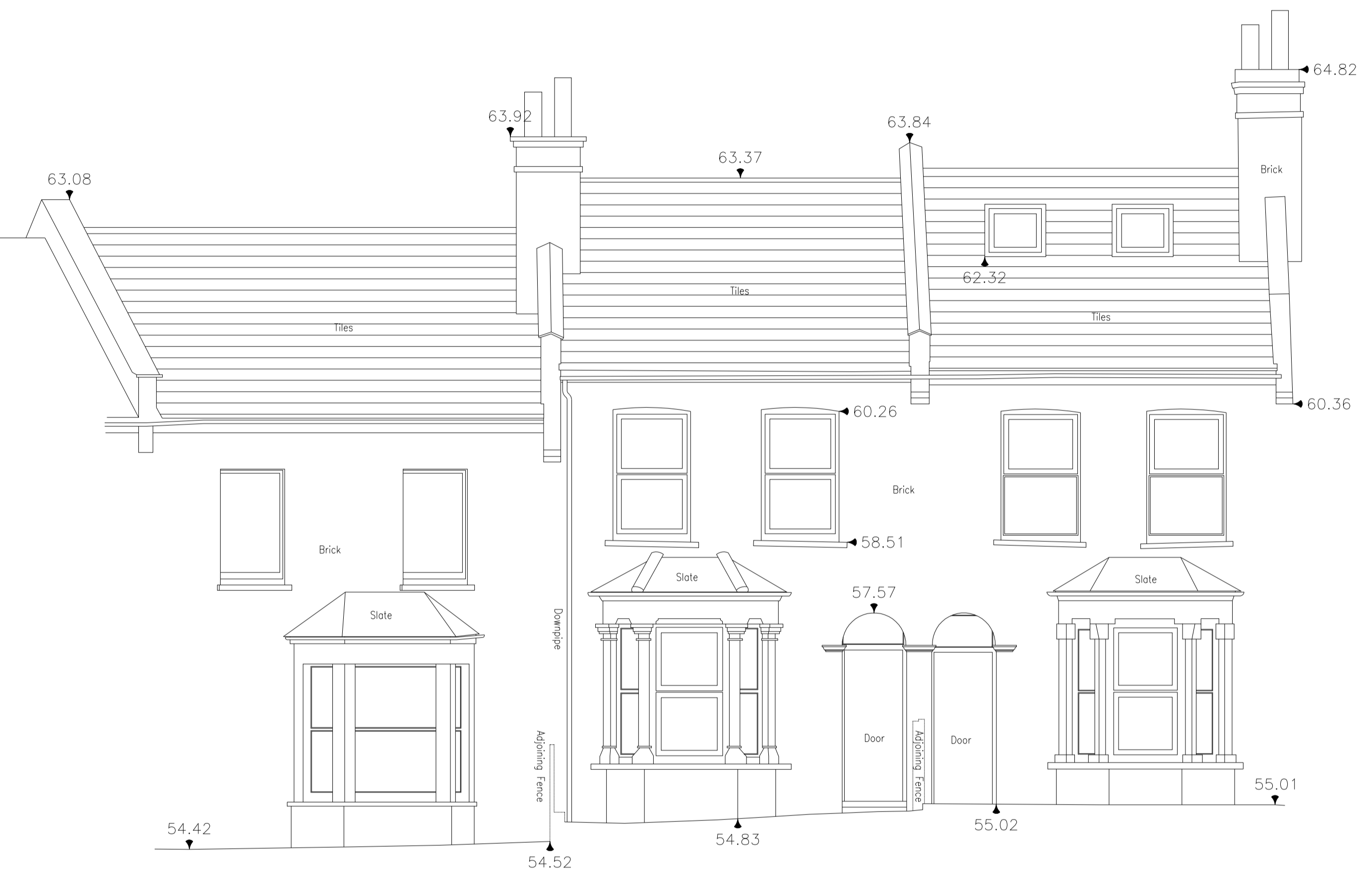
E EXISTING FRONT ELEVATION SCALE: 1:50 @ A1