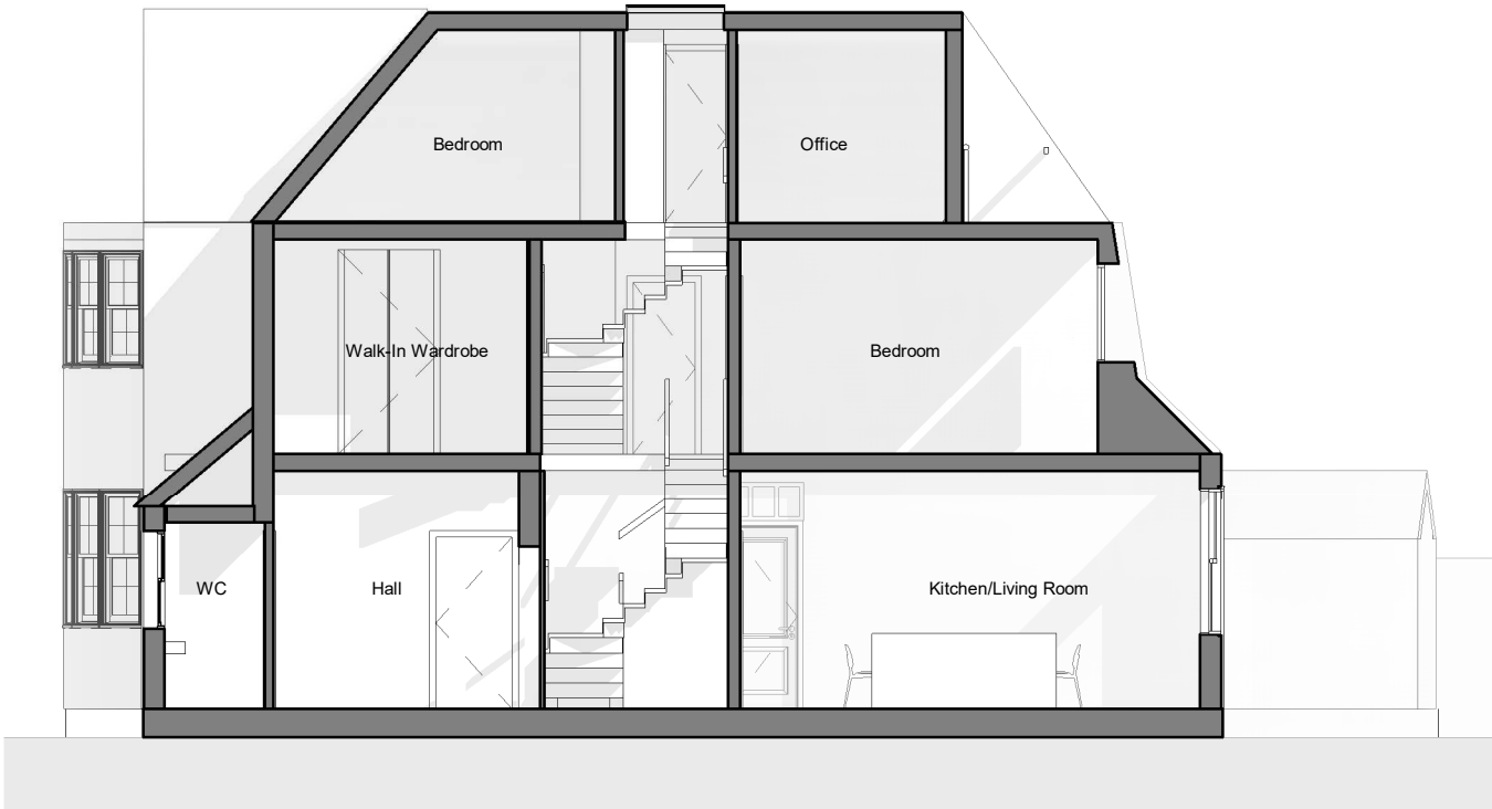
② Proposed Section A-A 1 : 100