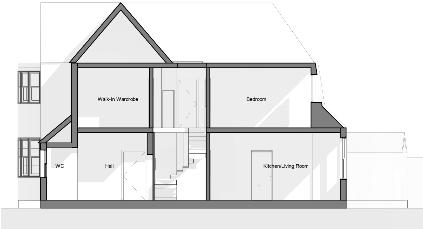
① Existing Section A-A 1 : 100