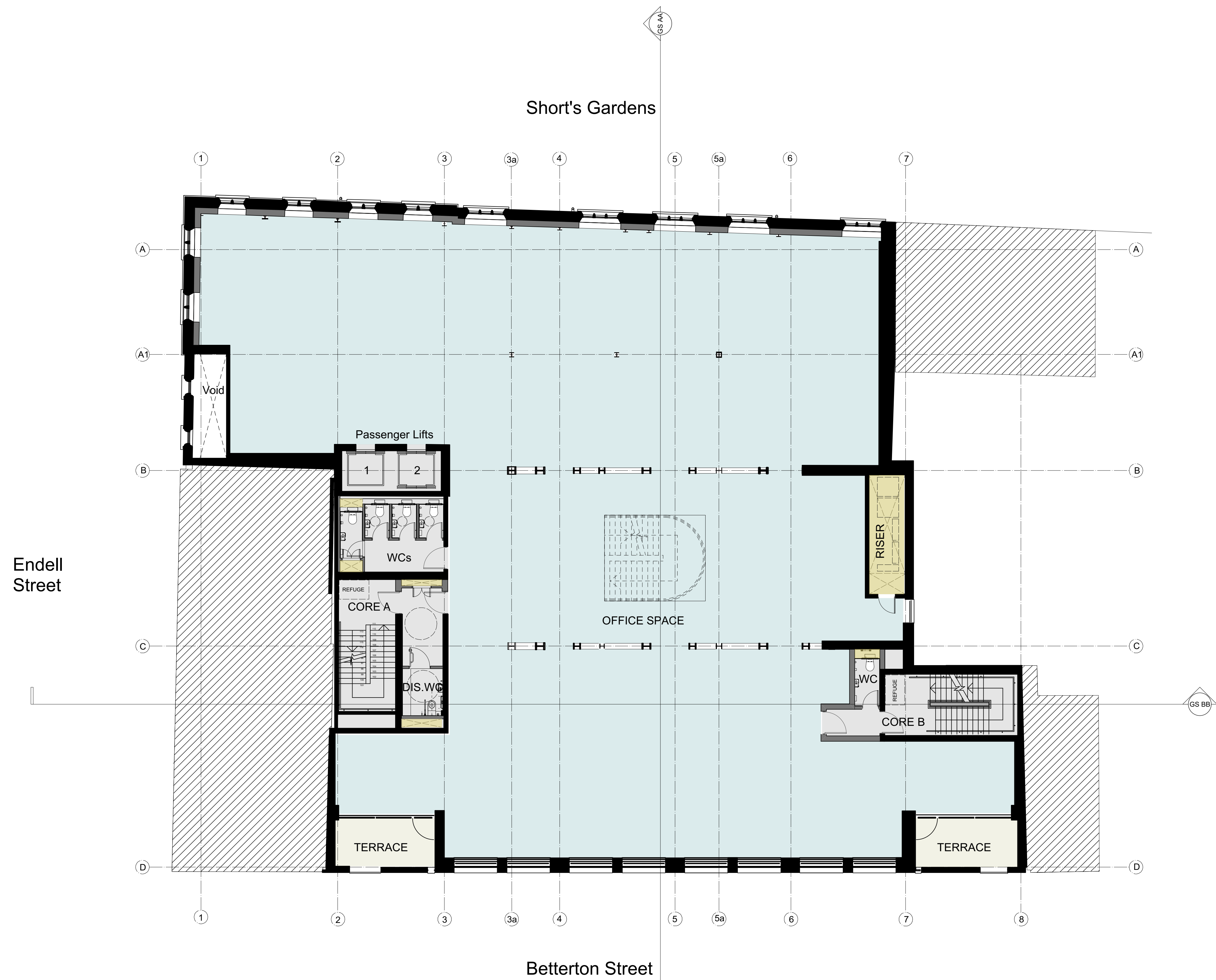
Third Floor Plan - Proposed Scale: 1:100