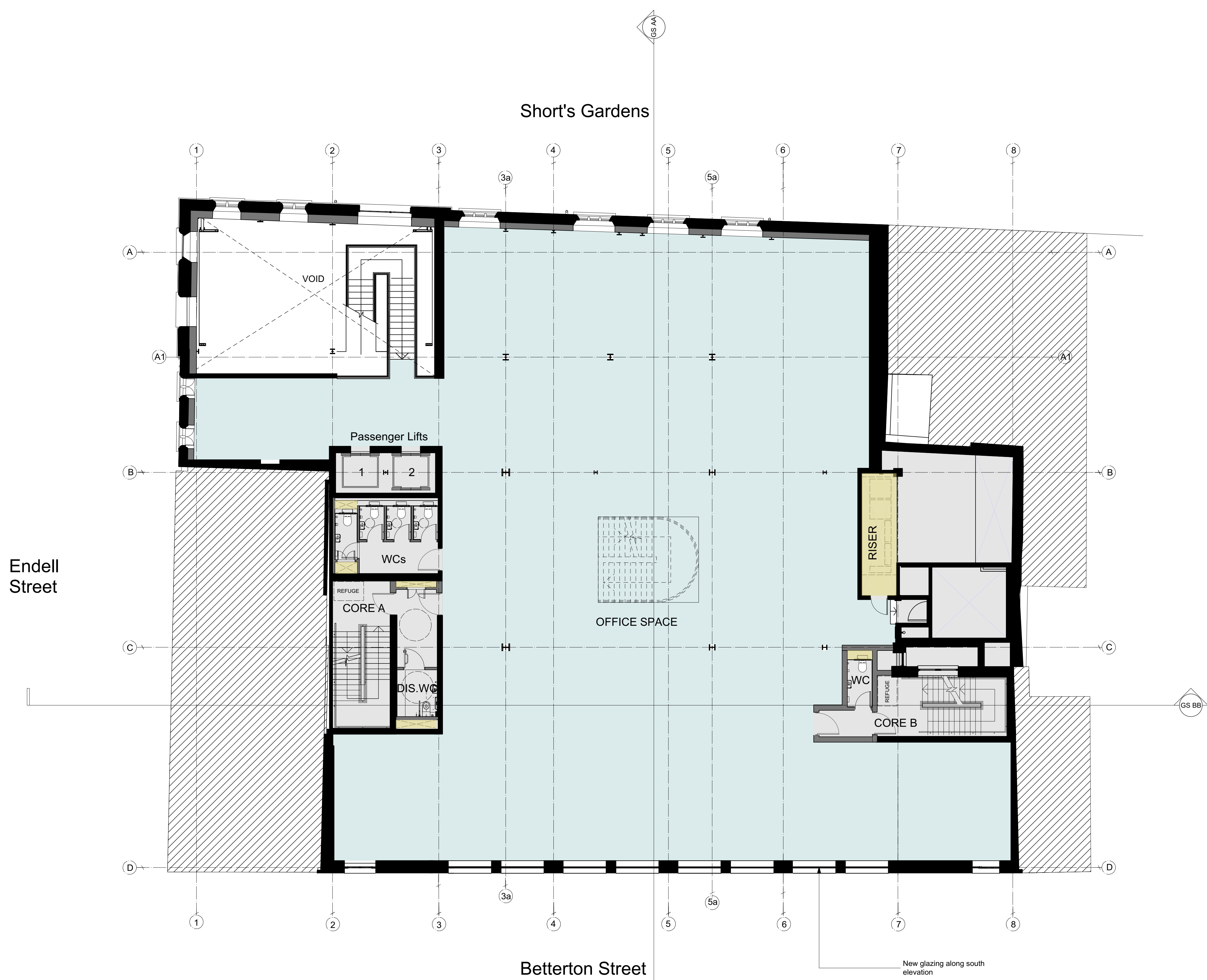
First Floor Plan - Proposed Scale: 1:100