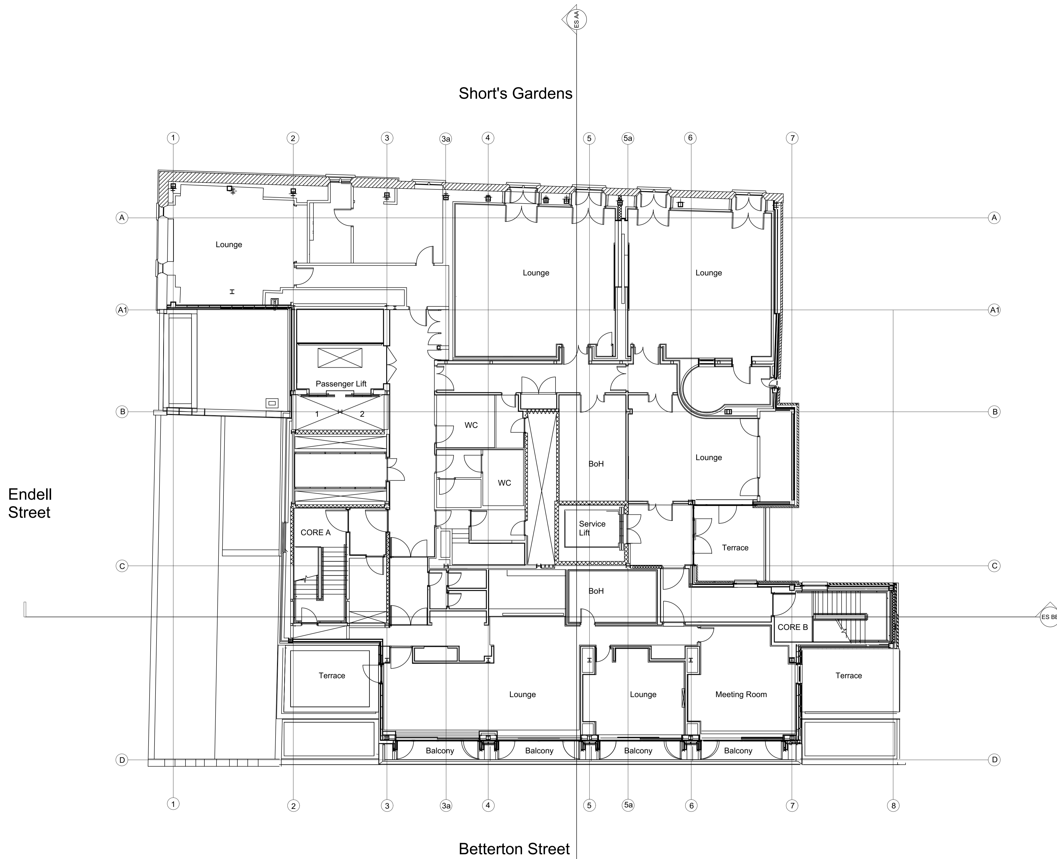
Fourth Floor Plan - Existing Scale: 1:100