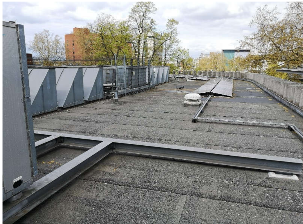
Fig. 6 General roof arrangement