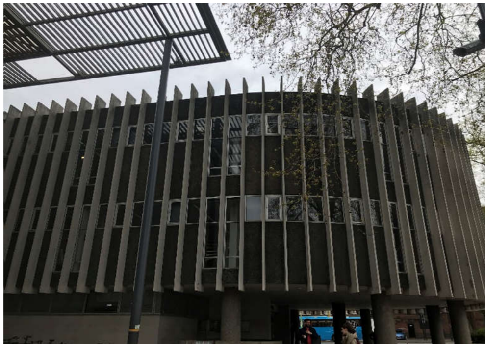
Fig. 3 Southern curved elevation