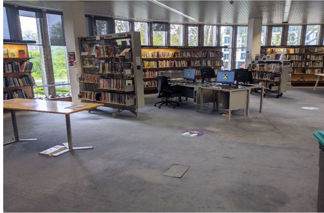
Fig. 24 Internal bookcase arrangement