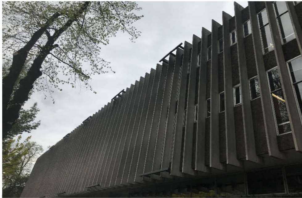
Fig. 1 External west elevation