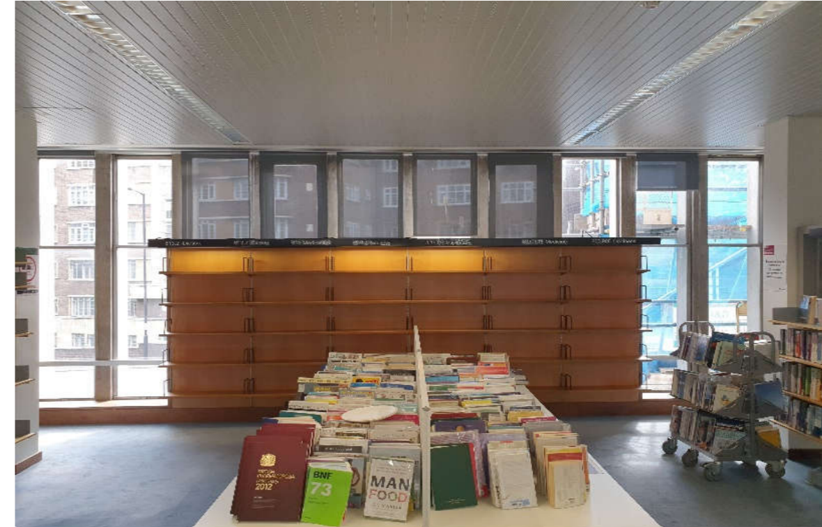
Fig. 25 Typical bookcase