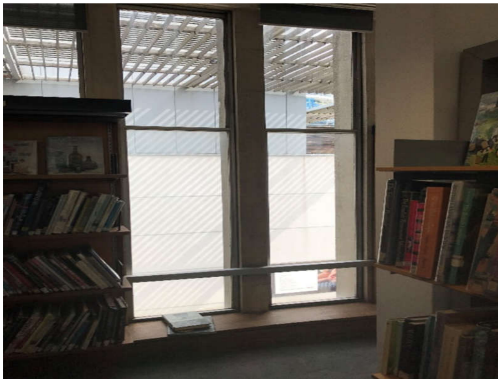
Fig. 20 First floor window arrangement