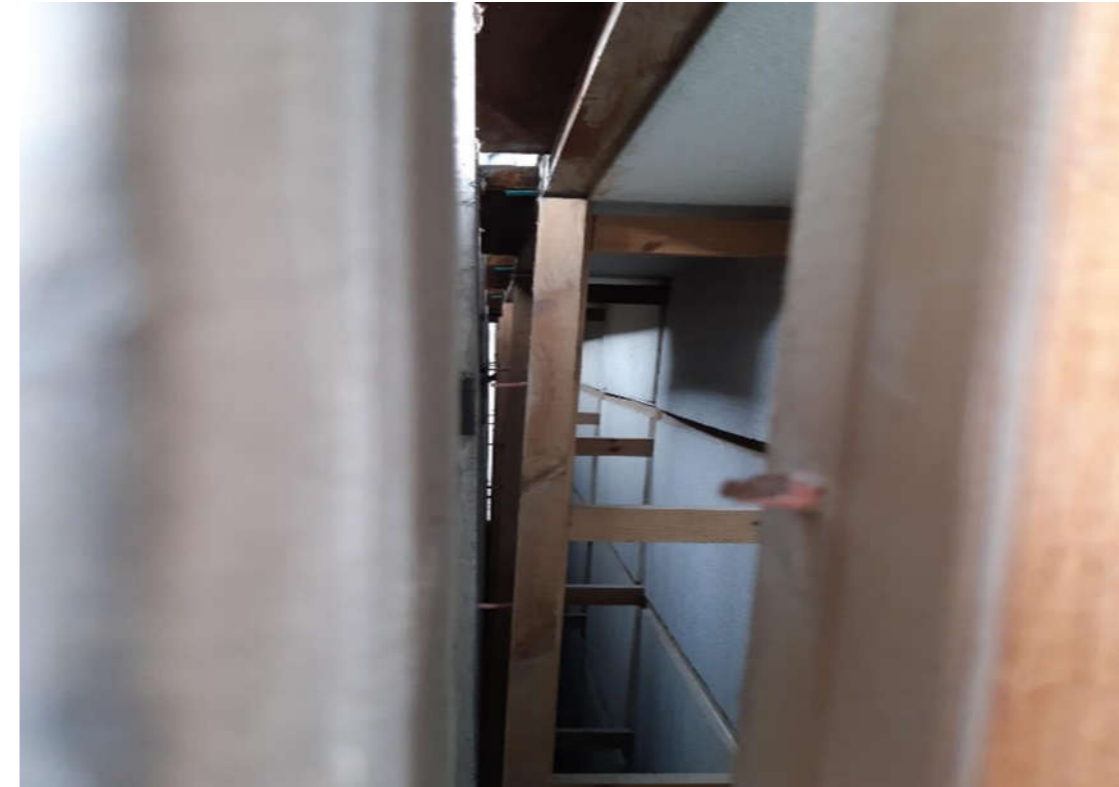
Fig. 29 Bookcase internal