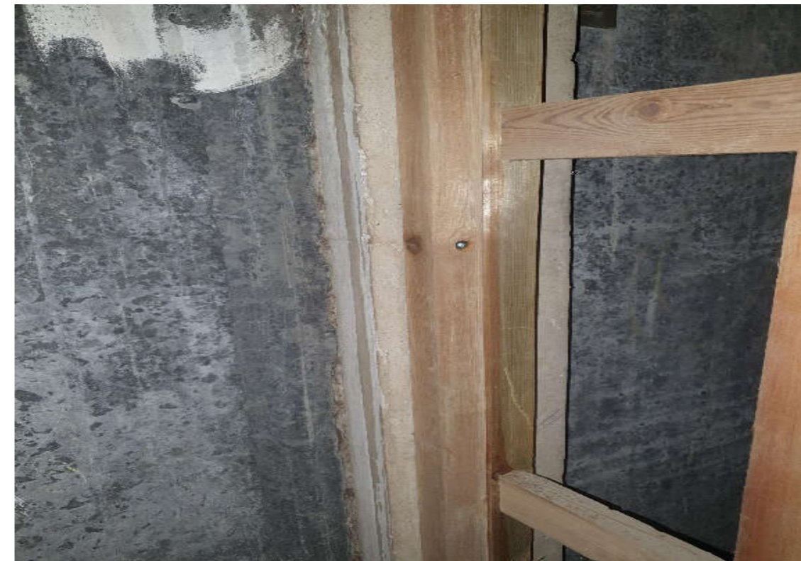
Fig. 31 Bookcase internal and concrete wall detail