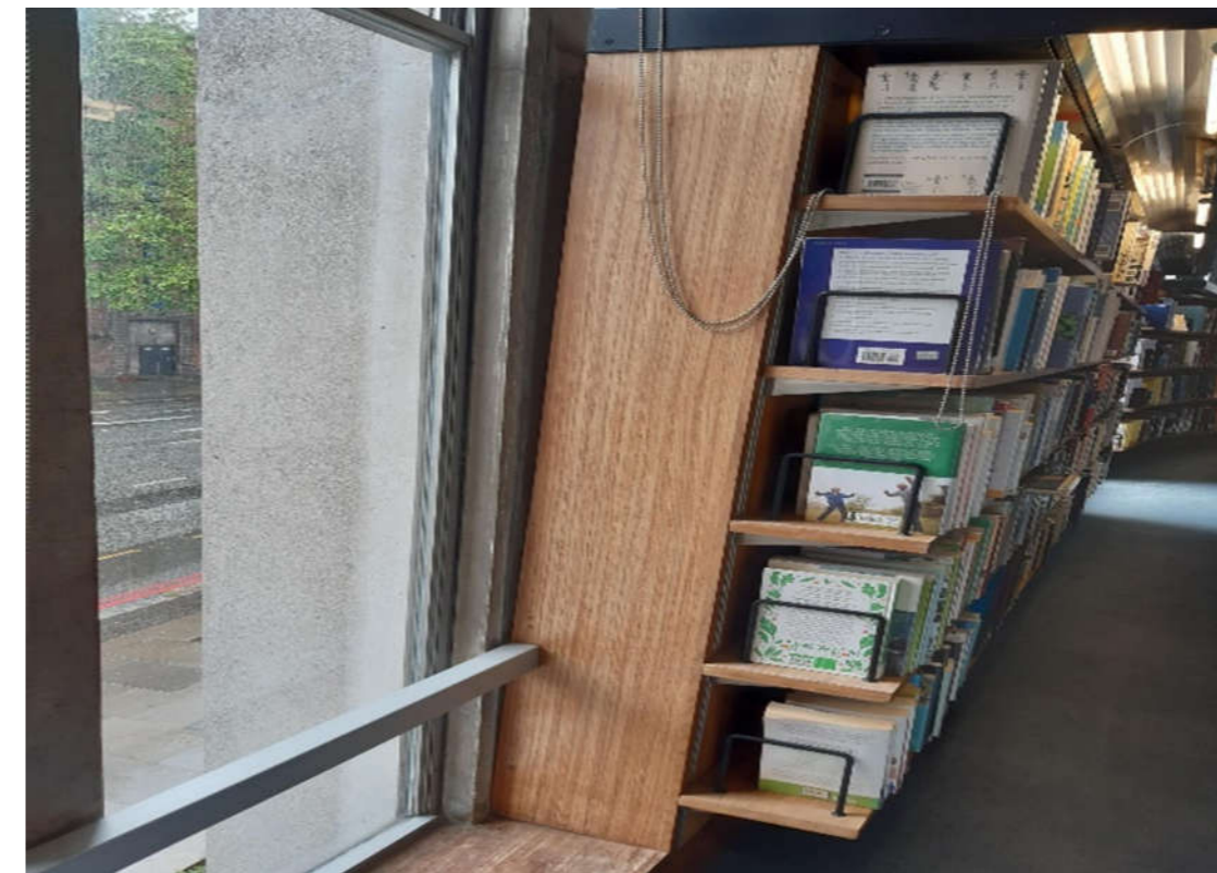
Fig. 27 Bookcase coming away from wall