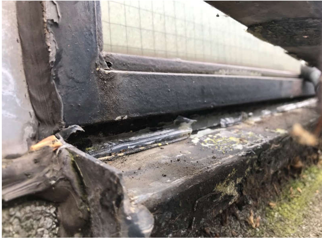
Fig. 14 Existing upstand detail to northlights