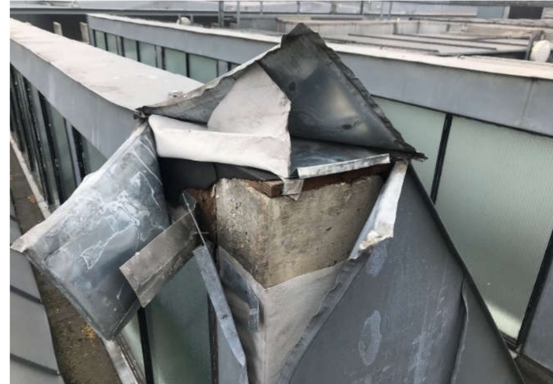
Fig. 15 Northlight opening up works