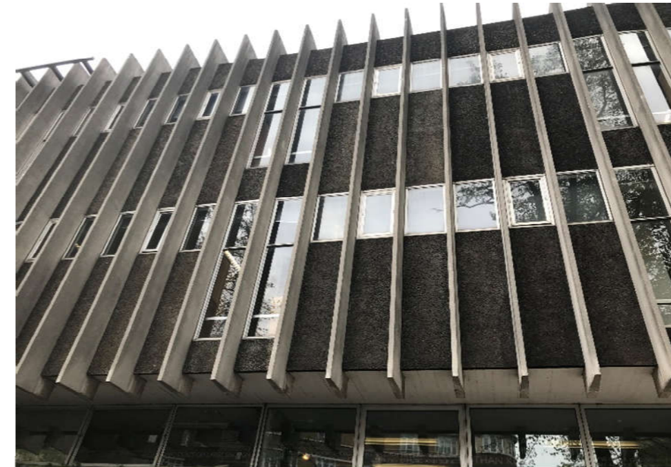
Fig. 2 Window arrangement