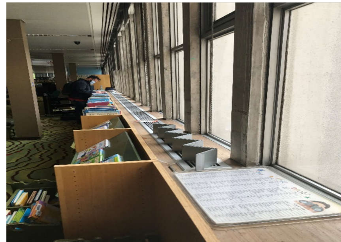
Fig. 21 First floor window arrangement