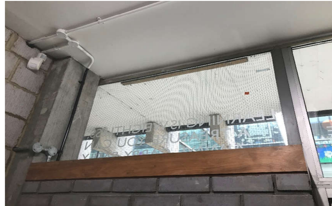
Fig. 19 Ground floor window replacement (Internal)