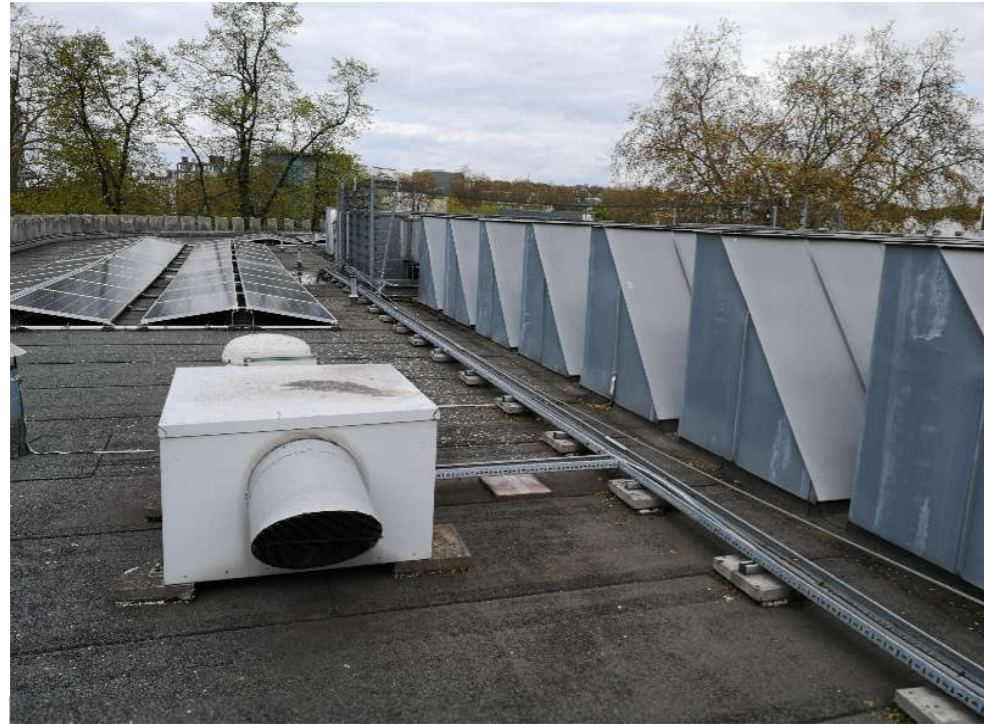
Fig. 10 Roof / northlight arrangement