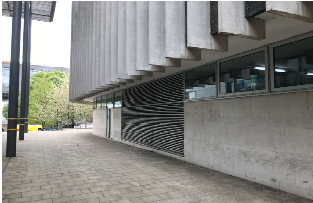
Fig. 18 Ground floor window replacements (external)