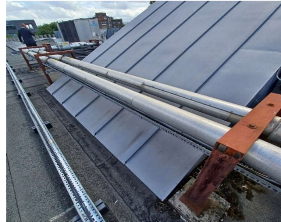
Fig. 7 Roof detail