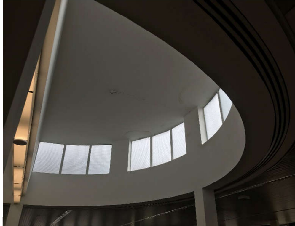
Fig. 5 Internal curved lightwell