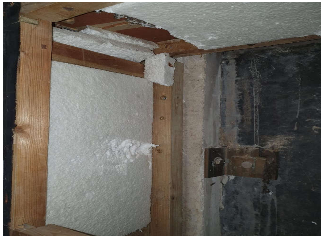
Fig. 30 Bookcase internal and polystyrene insulation