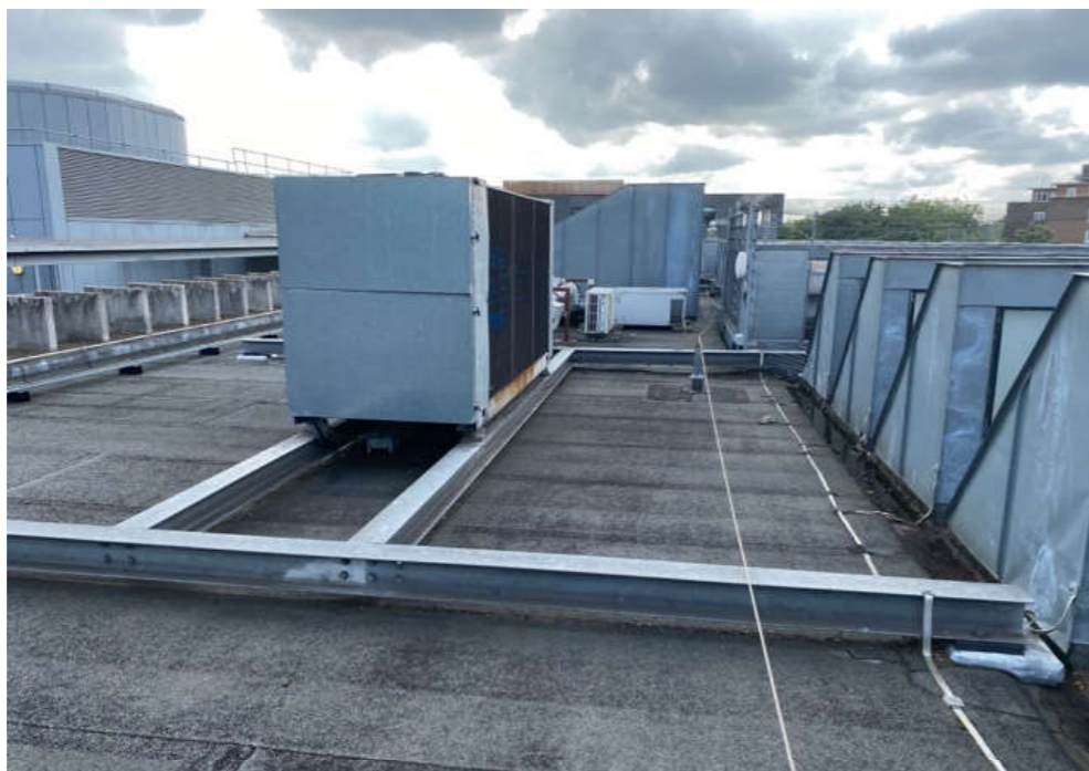
Fig.8 RSJ' for plant