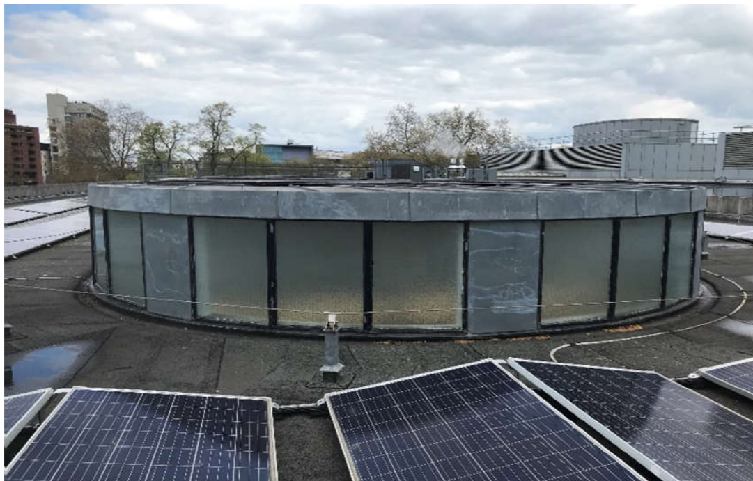
Fig. 16 Curved lightwell