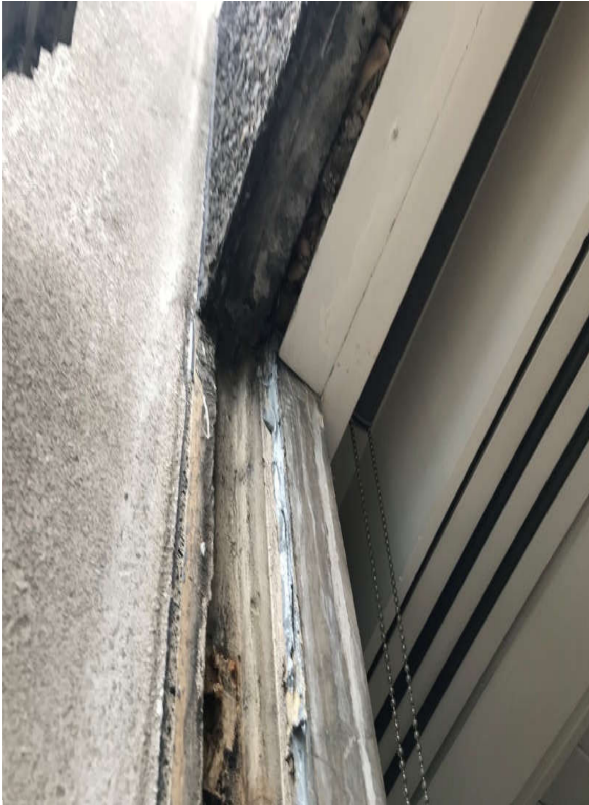
Fig. 22 Window reveal