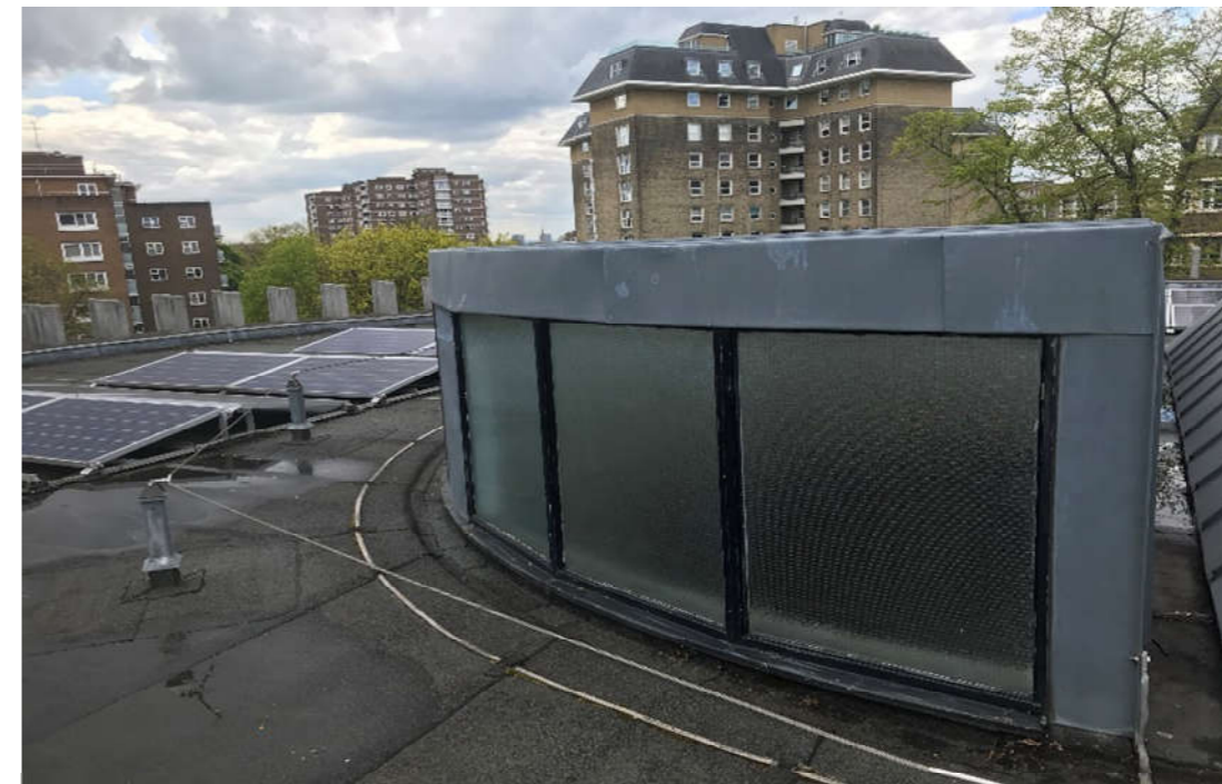
Fig. 17 Curved lightwell profile