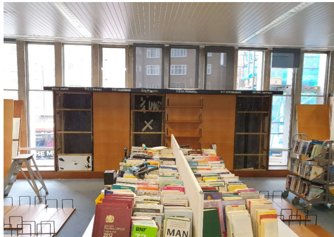
Fig. 26 Bookcase opened up