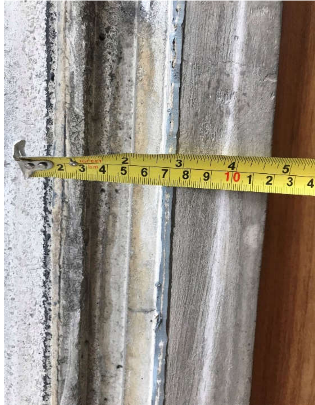
Fig. 23 Window profile depth