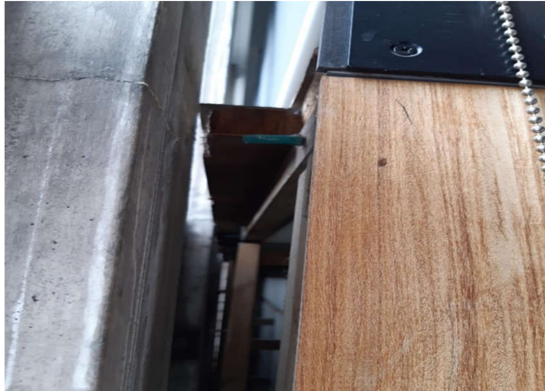
Fig. 28 Close up of bookcase coming away from wall