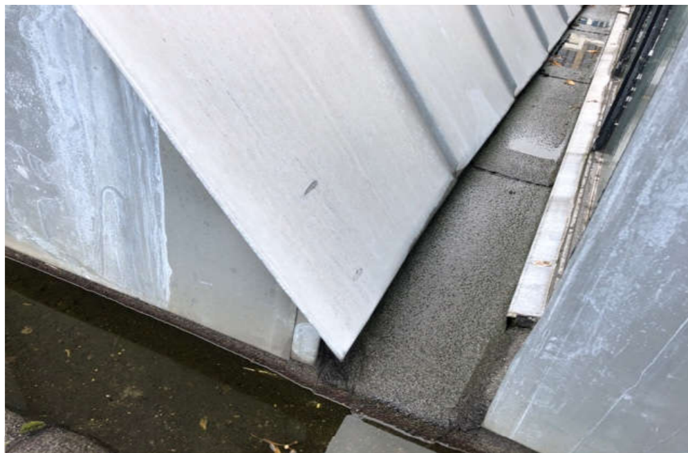
Fig. 12 Roof between northlights