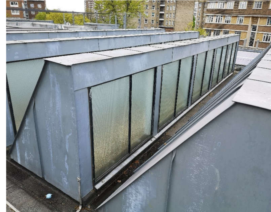
Fig. 11 Northlights