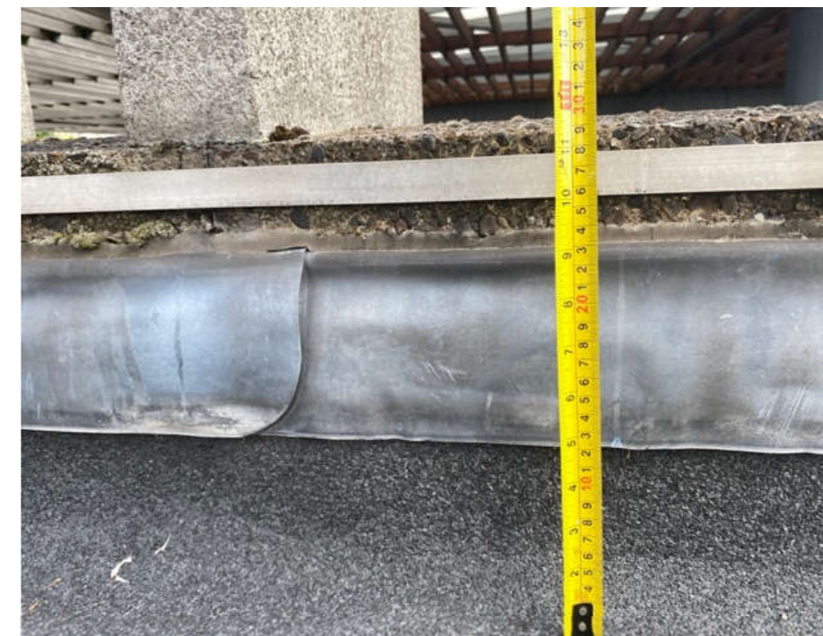
Fig. 9 Parapet heights