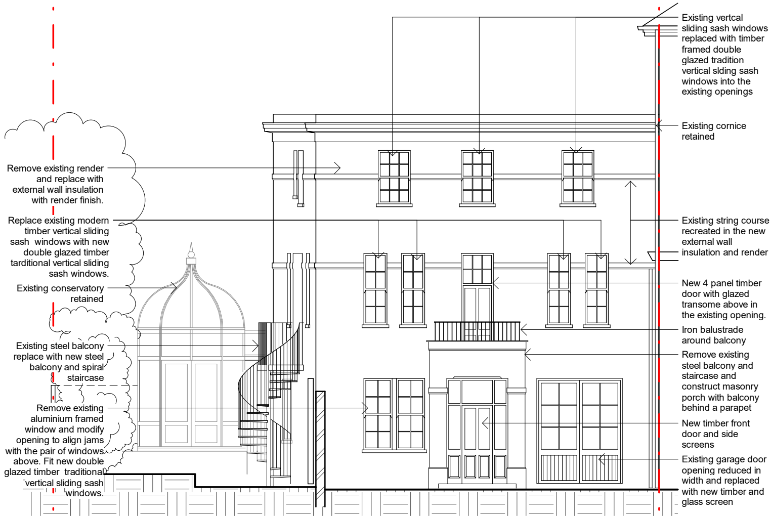
1 Proposed Elevation - Front 1 : 100