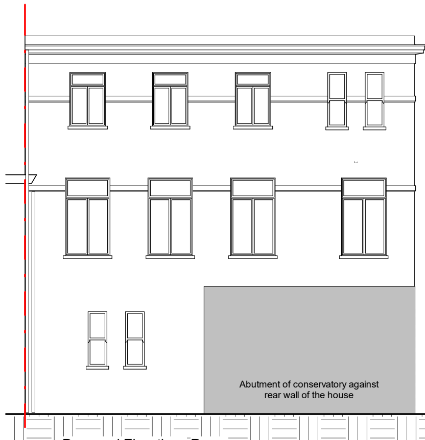
3 Proposed Elevation - Rear - showing part behind the conservatory Copy 1 1 : 100

Rev A : 05/10/2021 Annotation of windows clarified. Addition elevation added showing the lower part of the rear elevation