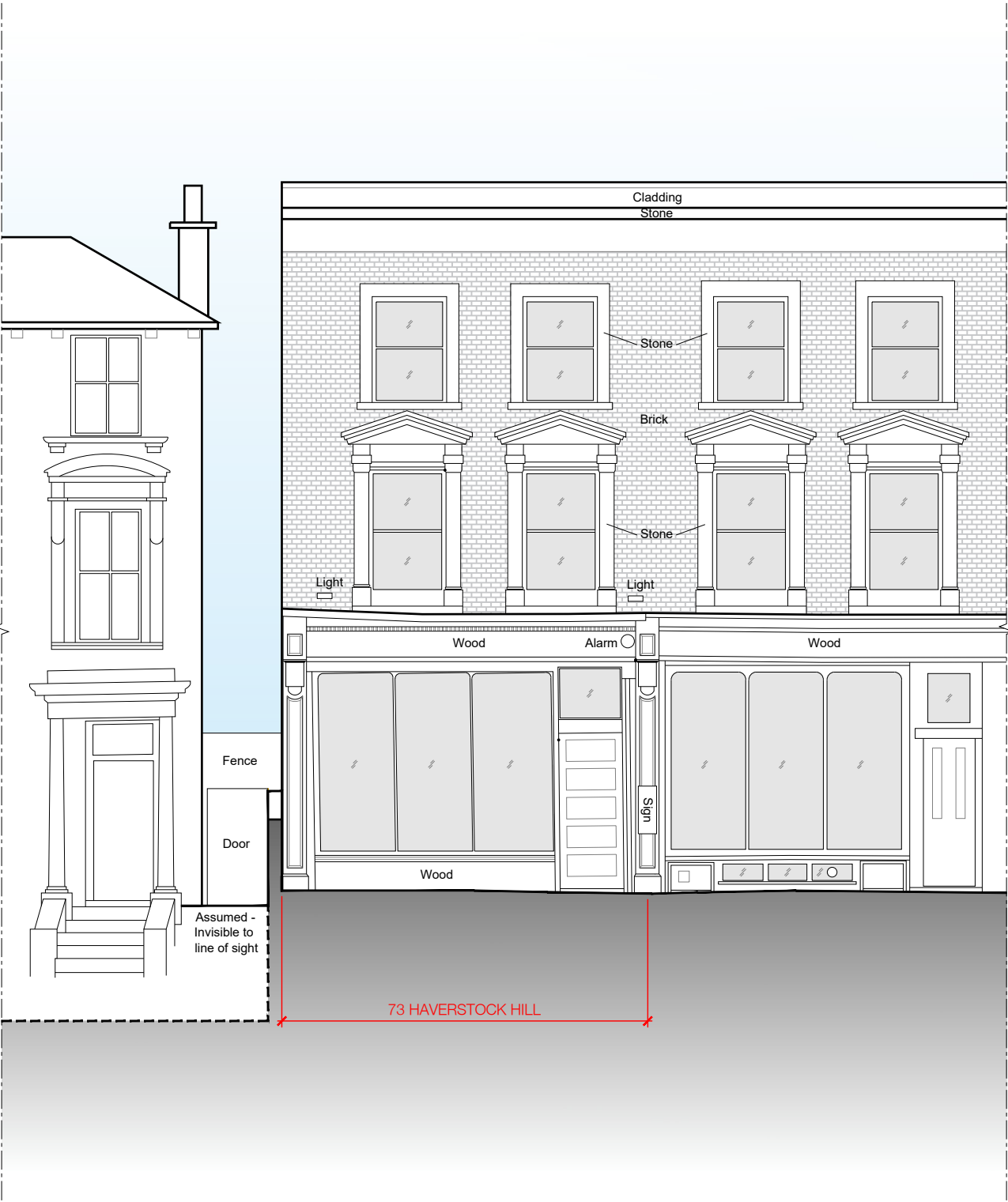
01 T020 FRONT ELEVATION - EXISTING SCALE 1:100 @ A3 - 1:50 @ A1