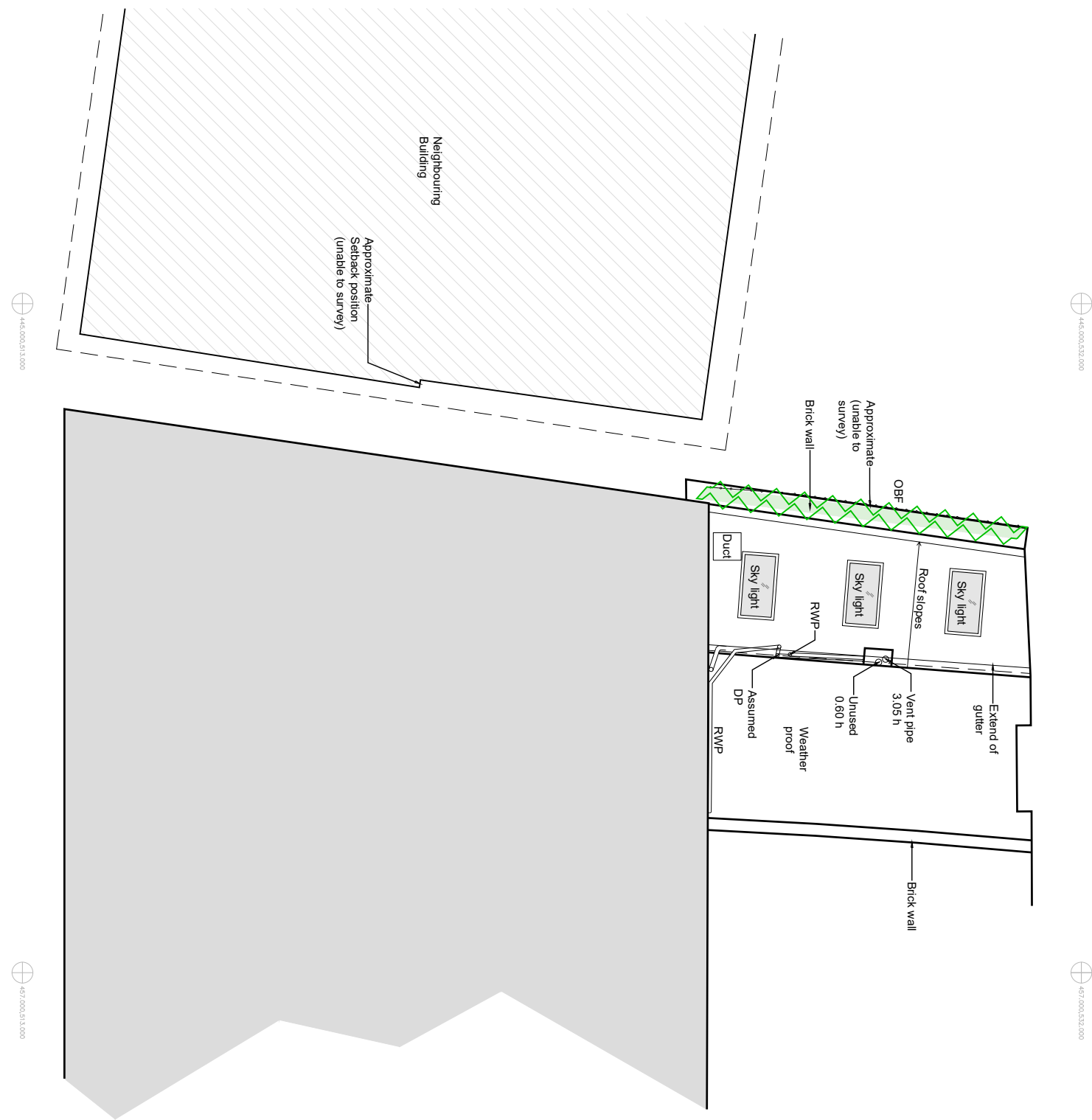
01 ROOF - EXISTING T012 SCALE 1:100 @ A3 - 1:50 @ A1