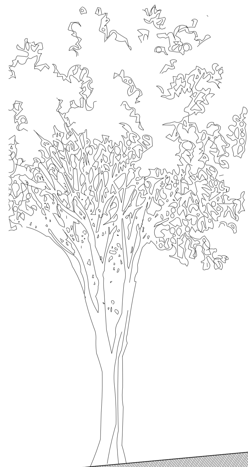
Proposed Section D-D