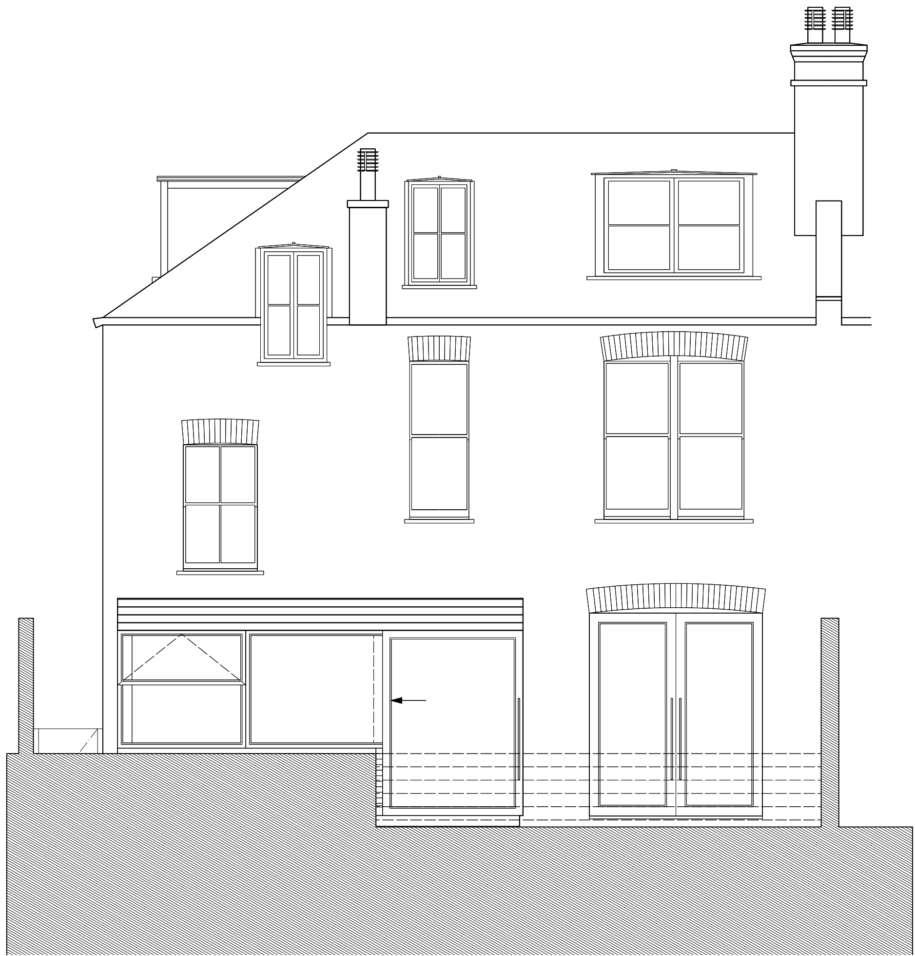
Existing Rear Elvation