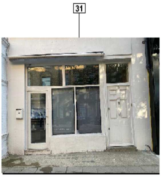
Photograph Showing Existing Front Elevation