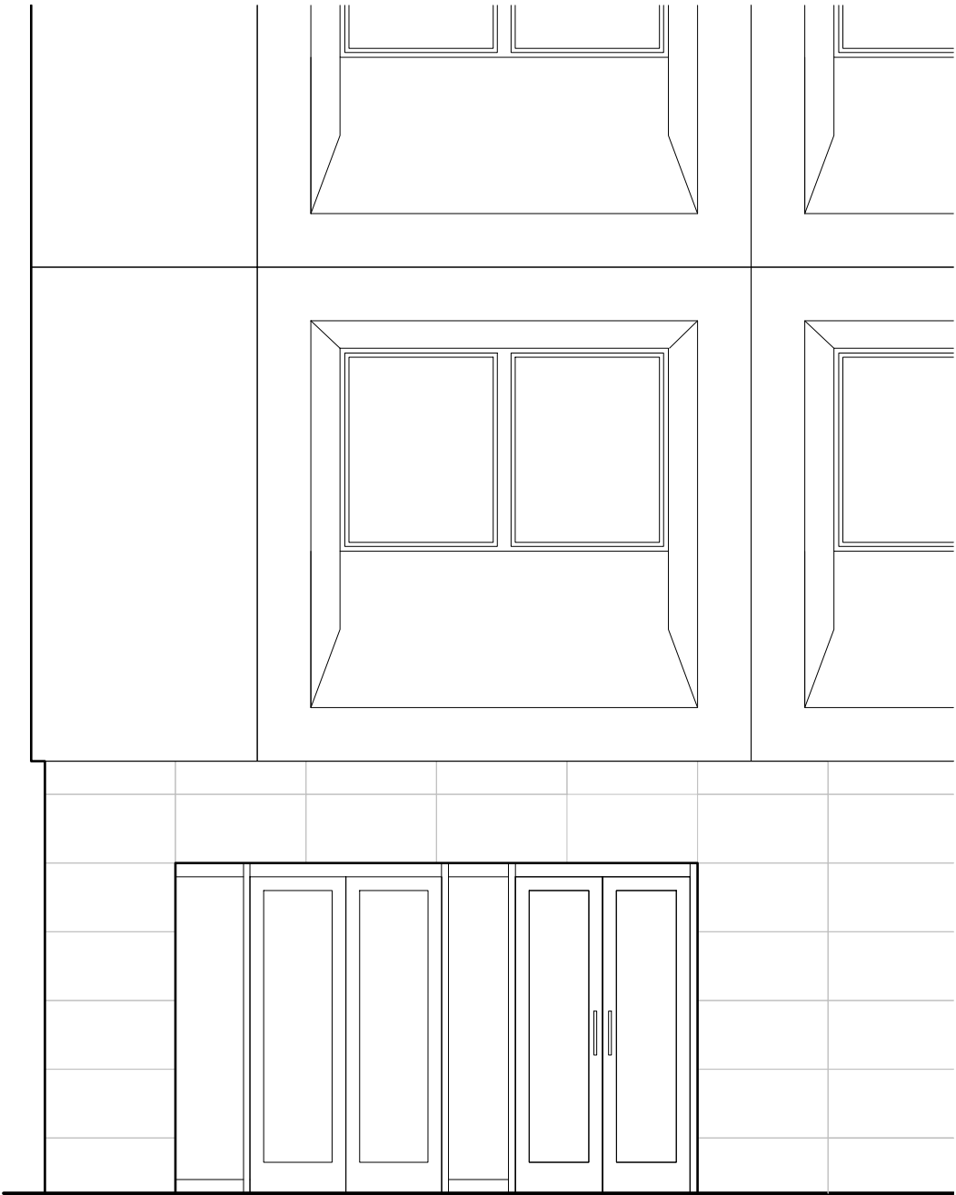
EXISTING PART FRONT ELEVATION