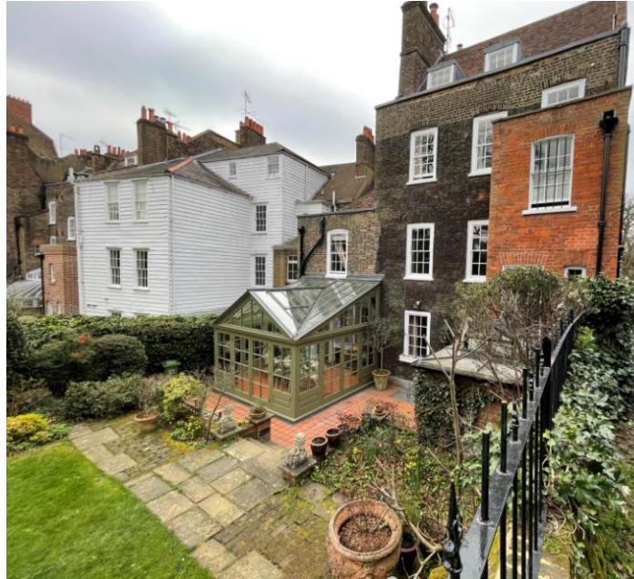
Conservatory and rear terrace as existing.

12 Church Row, London. NW3 6UT - Photos of existing rear of house.