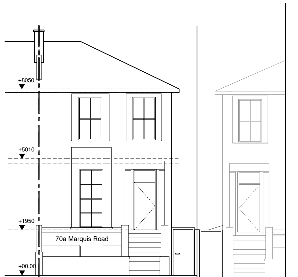
FRONT ELEVATION EXISTING SCALE 1:100