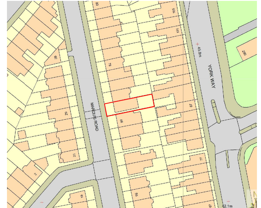
LOCATION PLAN SCALE: NTS