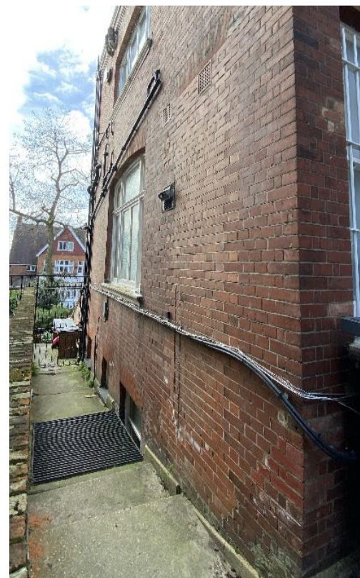
PHOTOGRAPH OF STICED BRICKWORK TO HISTORIC DOORWAY TO SIDE ELEVATION

CONSENTED WINDOW AMENDED TO GLAZED METAL DOOR AND FAN LIGHT (TRANSLUCENT) IN LOCATION OF HISTORIC DOORWAY.