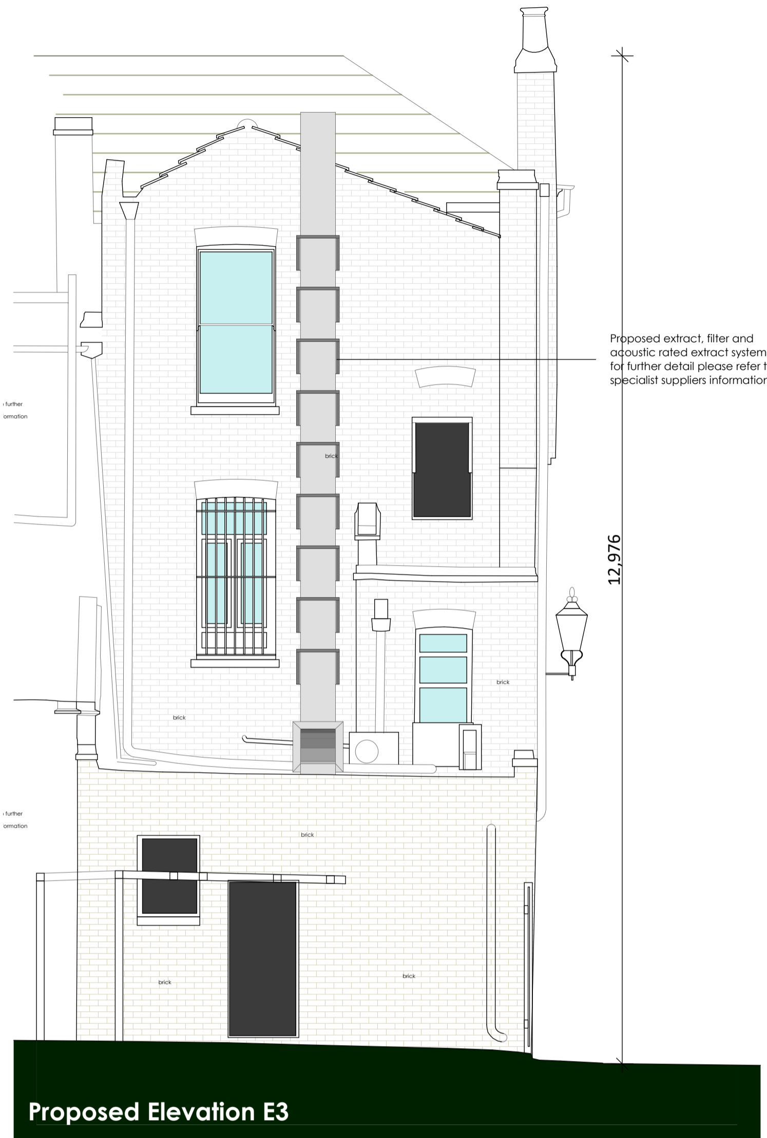
Proposed Elevation E3

Note: Existing shop front to be fully retained, area to be redecorated to suit Ready Burger brand image, colours as indicated above.