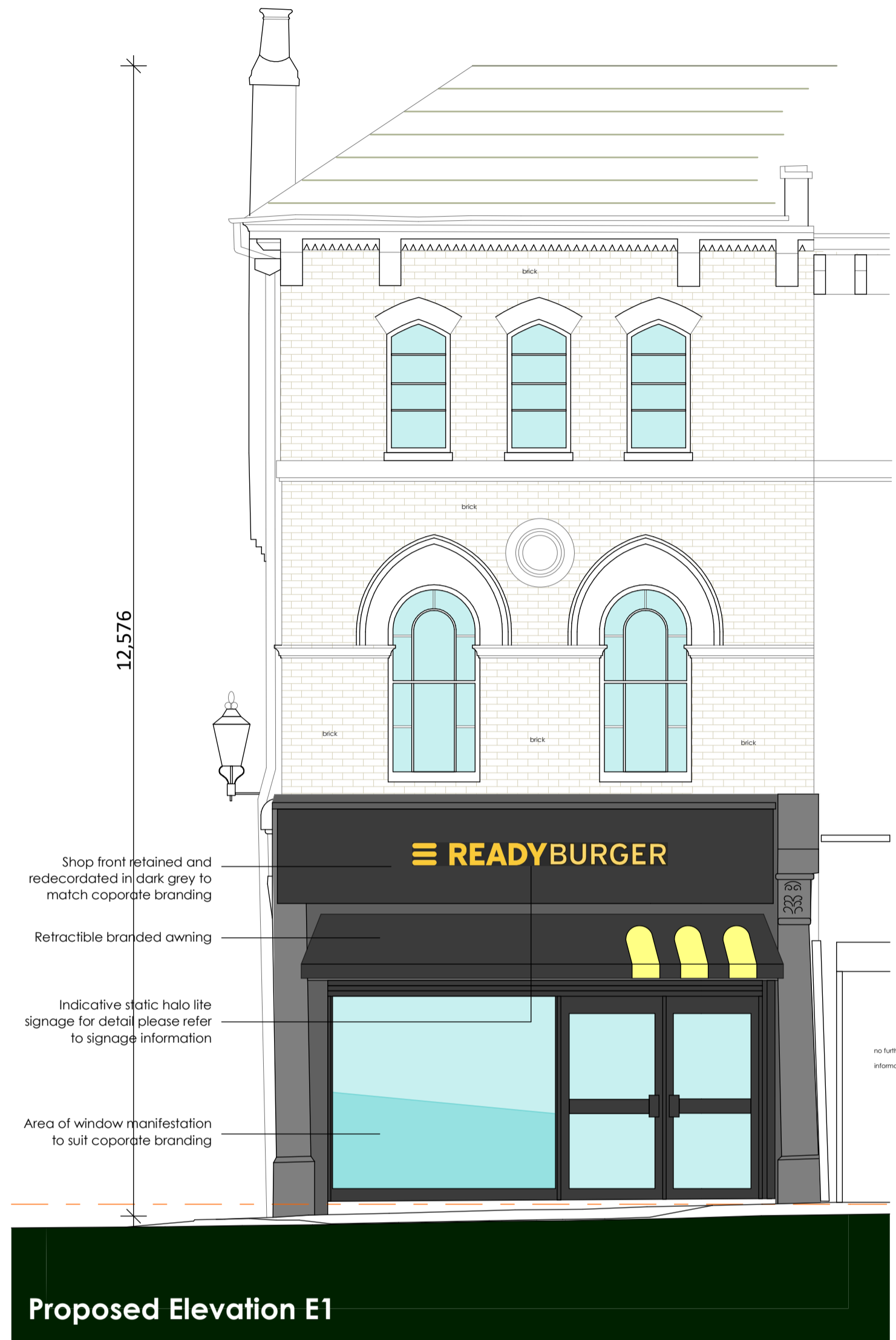
Proposed Elevation E1

Note: Existing shop front to be fully retained, area to be redecorated to suit Ready Burger brand image, colours as indicated above.