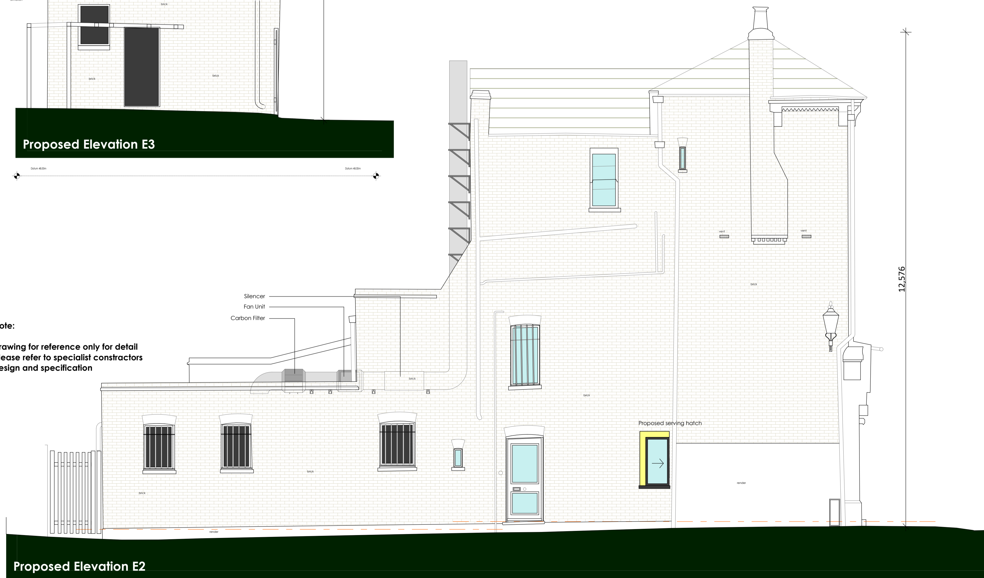
Proposed Elevation E2

Note: Drawing for reference only for detail please refer to specialist contractors design and specification