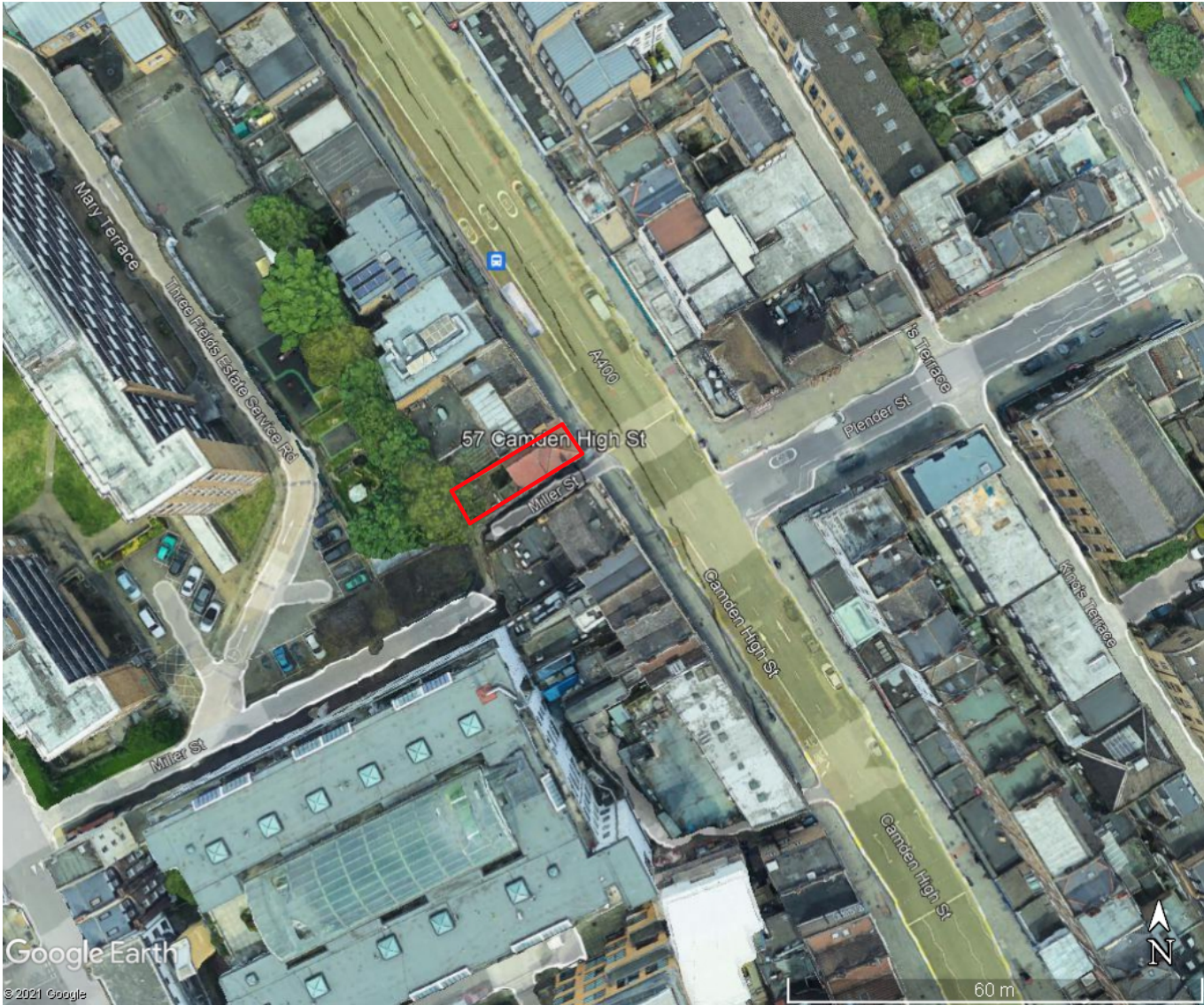
AERIAL IMAGE - NOT TO SCALE