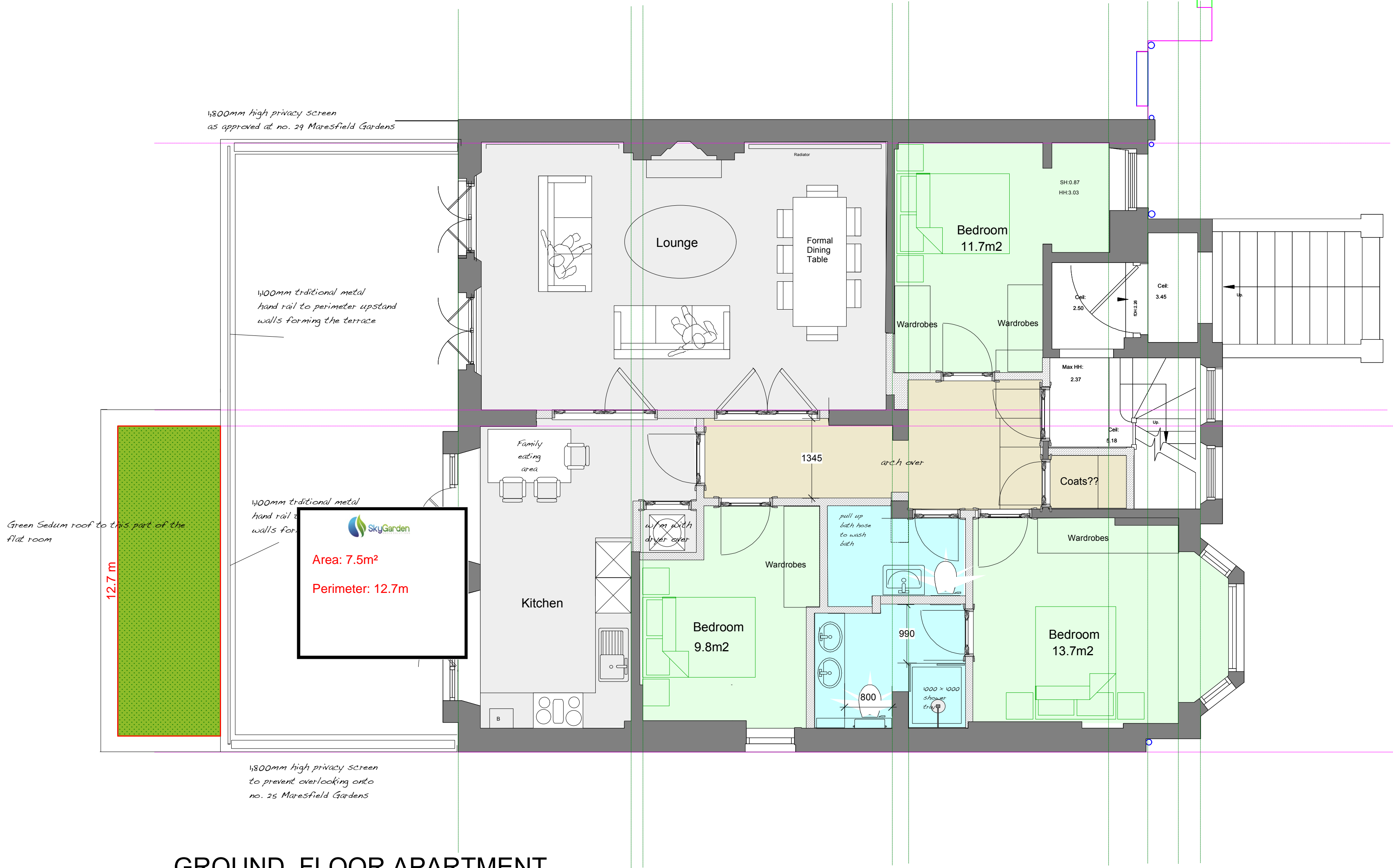
GROUND FLOOR APARTMENT