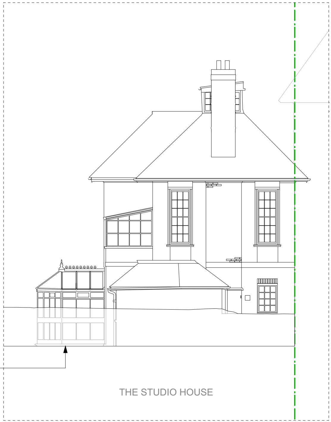
THE STUDIO HOUSE