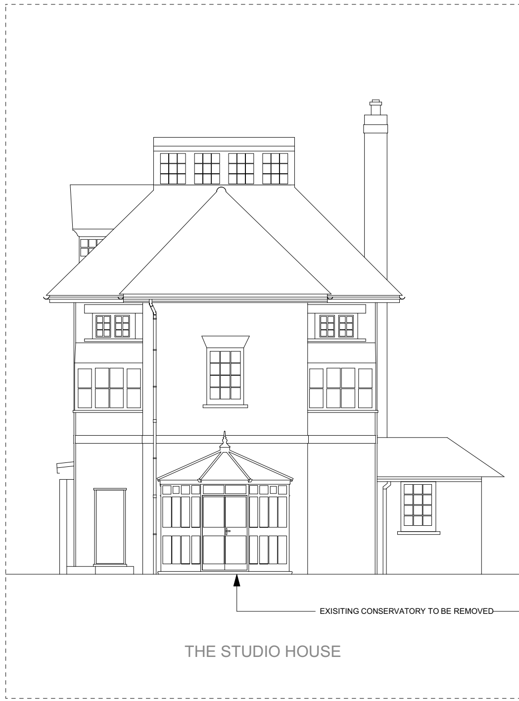
THE STUDIO HOUSE