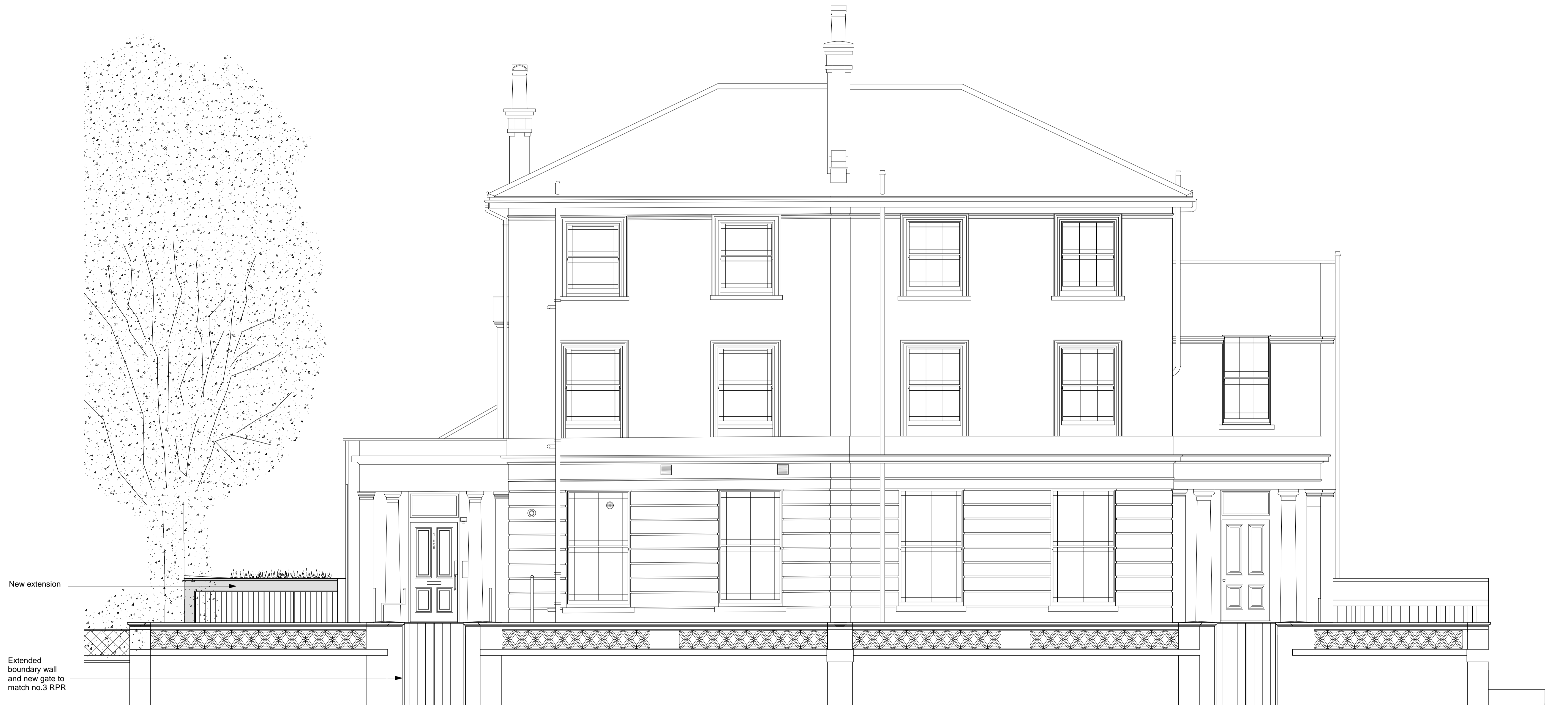
Proposed street front elevation (no 1A Regents Park Road)