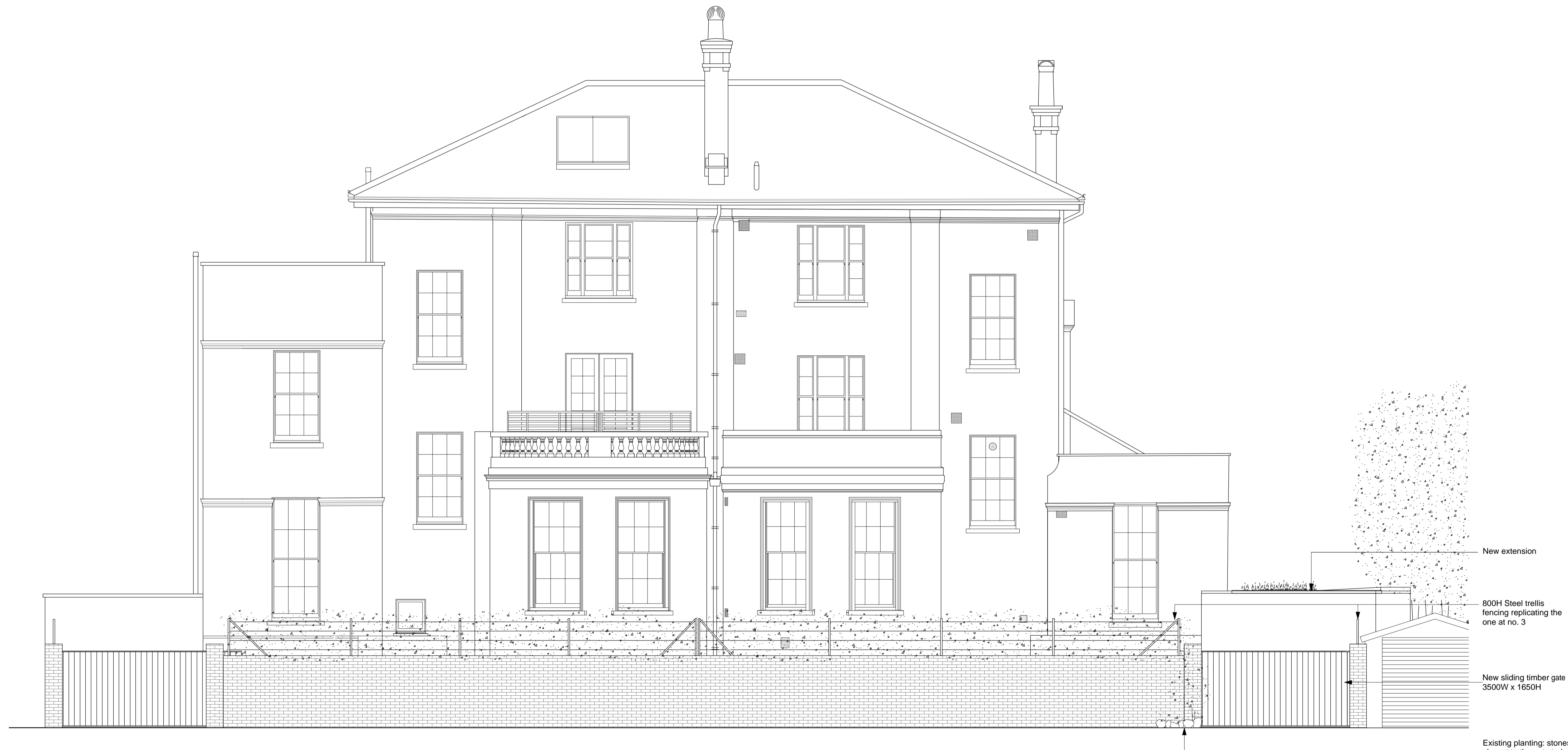
Existing rear elevation (no 3 Regents Park Road)