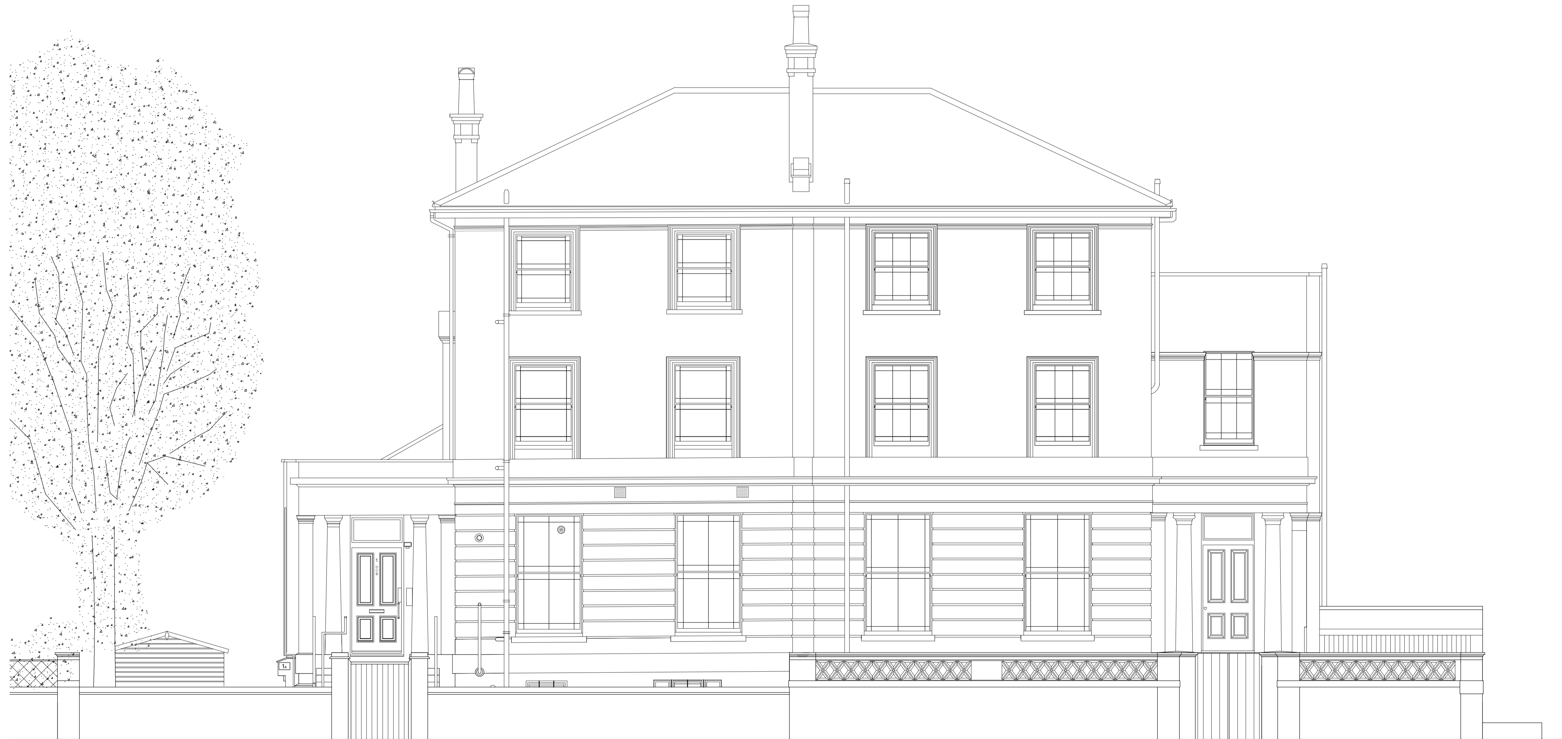
Existing street front elevation (no 1A Regent's Park Road)