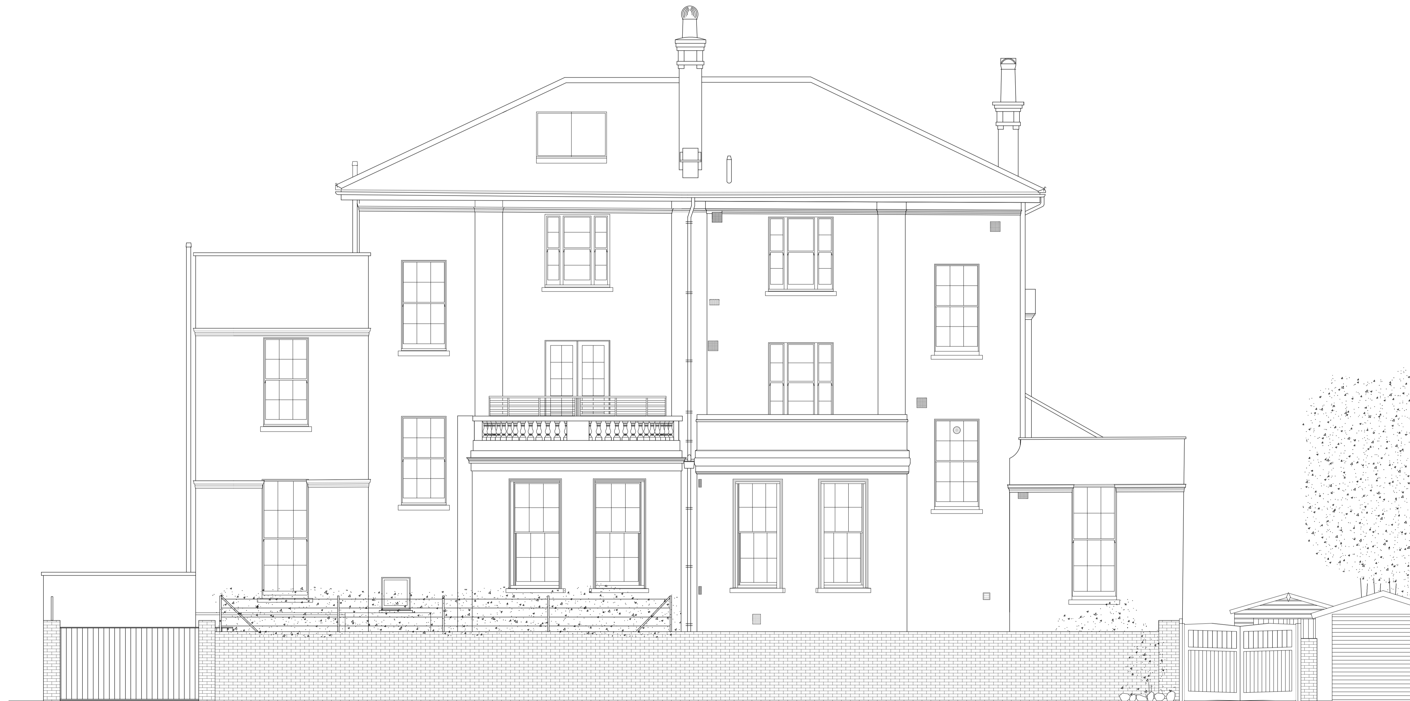
Existing rear elevation (no 3 Regents Park Road)