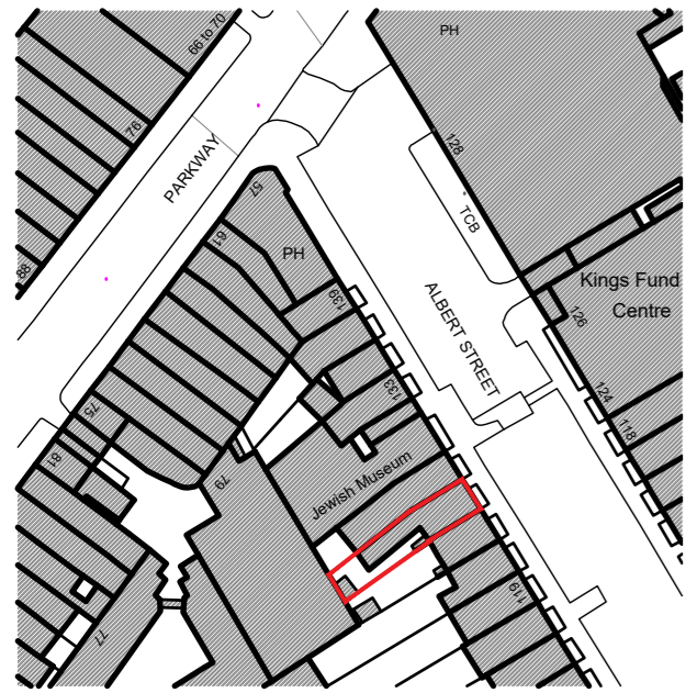
01 Existing Location Plan PL-0.00 1:1250