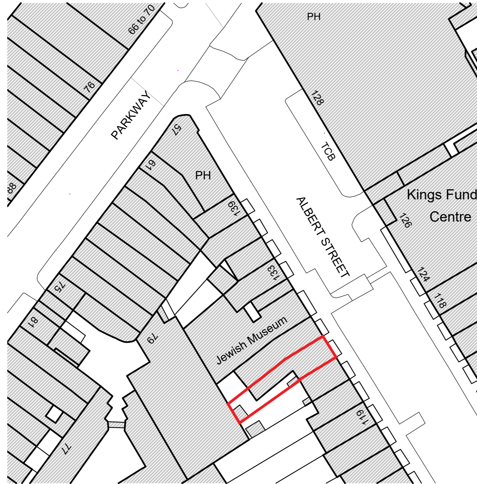
03 Existing Site Plan PL-0.00 1:500