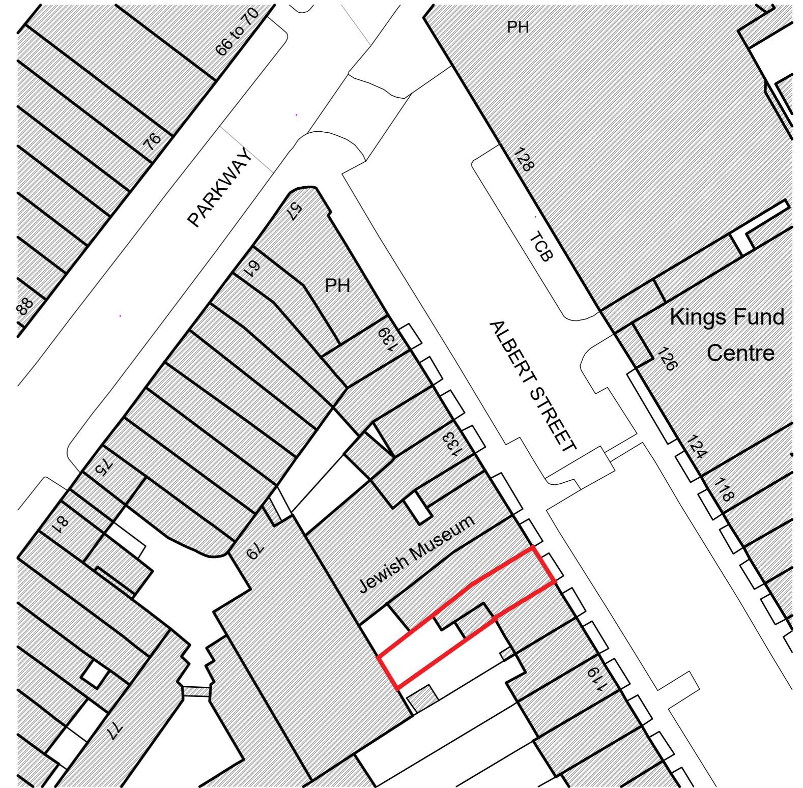
04 Proposed Site Plan PL-0.00 1:500