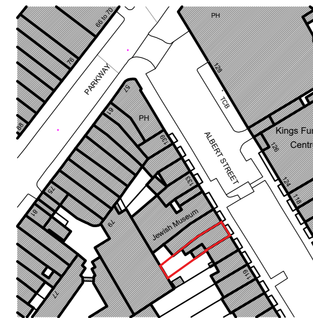
02 Proposed Location Plan PL-0.00 1:1250