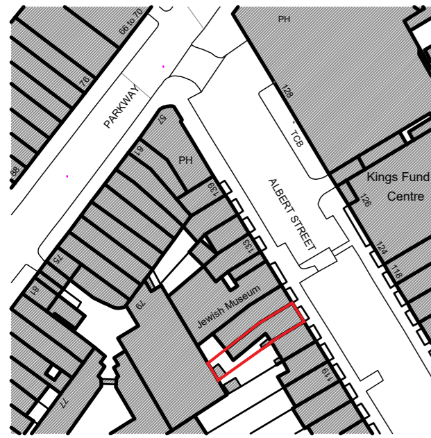
01 Existing Location Plan PL-0.00 1:1250