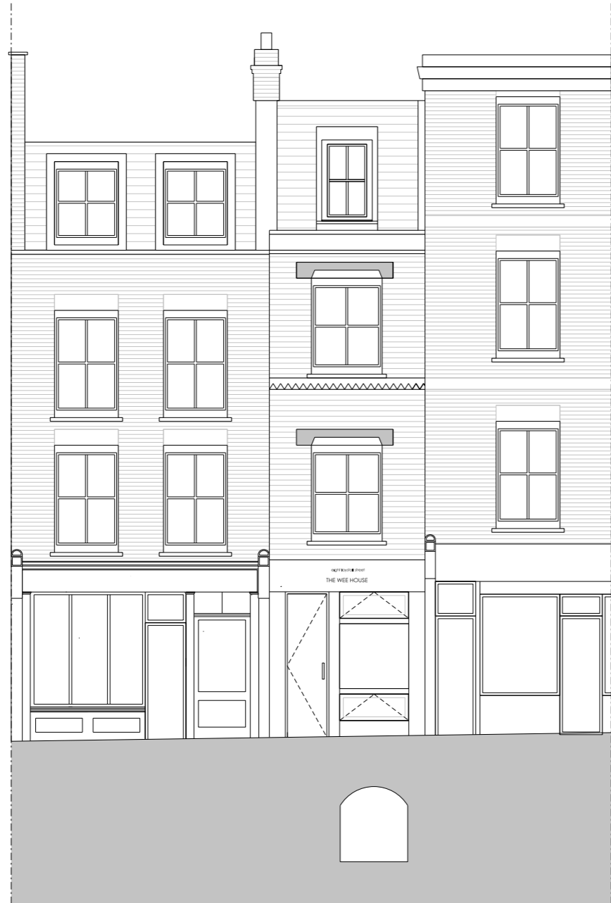
FRONT ELEVATION 01