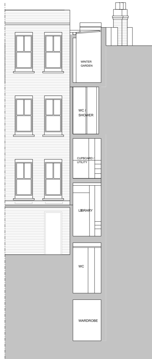
REAR ELEVATION 02