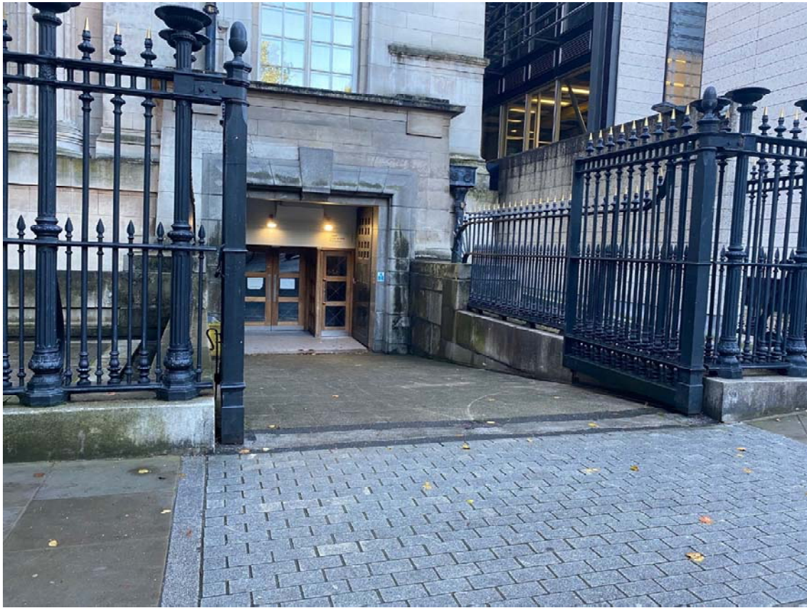
Existing elevation of Old Contractors entrance.