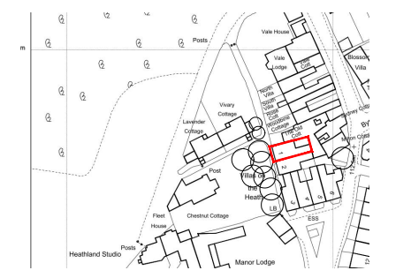
EXISTING LOCATION PLAN 1:1250@A1/1:2500 @ A3