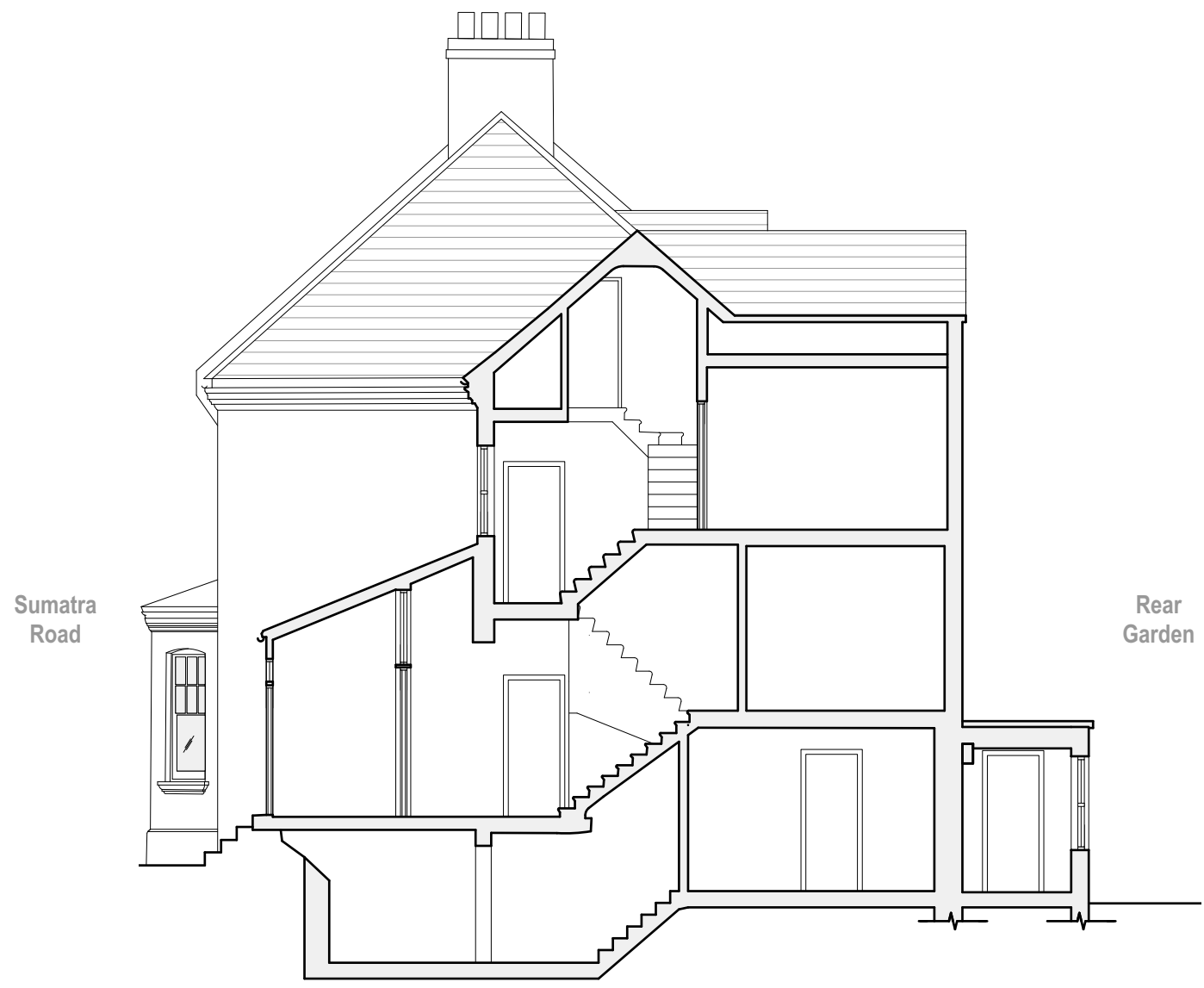
Existing Section AA