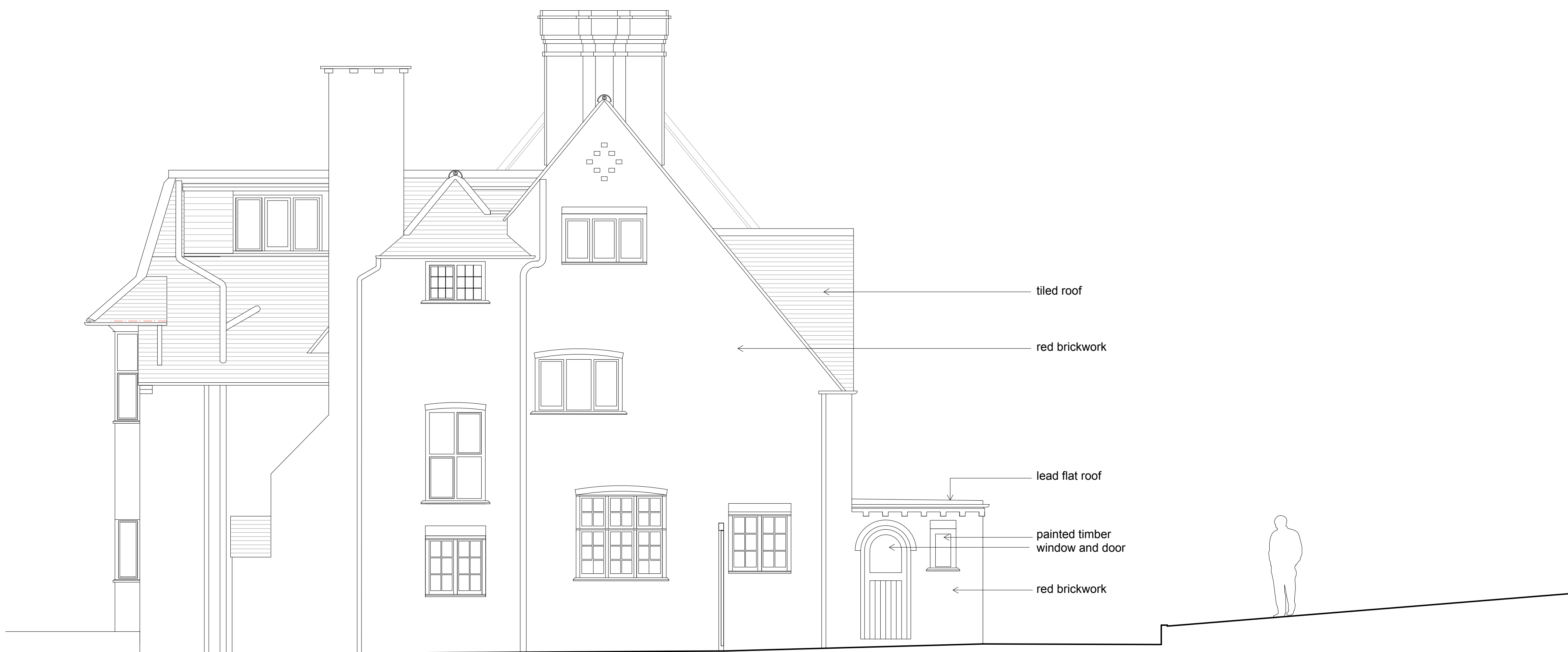
SIDE ELEVATION AS EXISTING